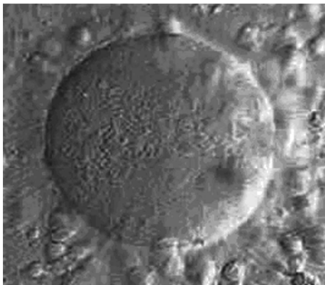
Figure 1 | The morphology for human oocytes within human ovarian cortex tissues.

In conclusion, our novel technology by using the S.C. procedure is very helpful in order to improve fertility of female cancer patients.