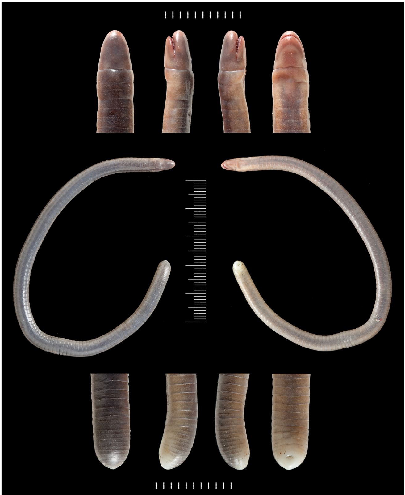
Figure 2. BMNH 2008.715, holotype of Microcaecilia dermatophaga sp. nov. Scale bars in mm. doi:10.1371/journal.pone.0057756.g002

a little paler, much paler midventrally between mandibles and on C1; paler (whitish) around nares, vent, and on posterior half of