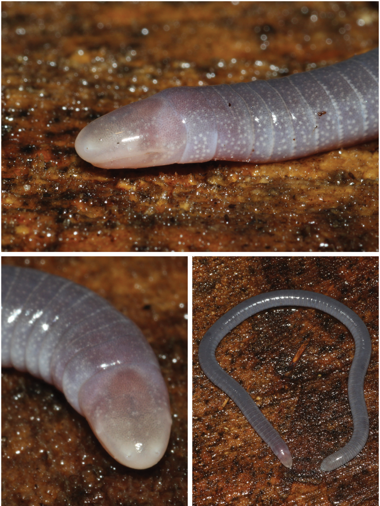
Figure 3. Holotype of Microcaecilia dermatophaga sp. nov. (BMNH 2008.715) in life. doi:10.1371/journal.pone.0057756.g003