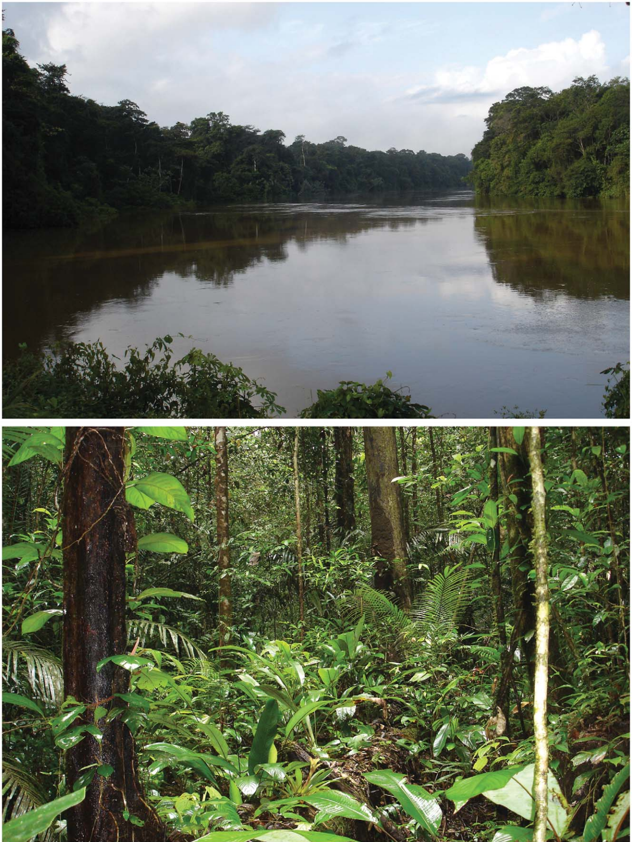
Figure 1. Type locality of Microcaecilia dermatophaga sp. nov. Forest (below) close to the Mana River (top) at Angoulême, French Guiana. doi:10.1371/journal.pone.0057756.g001