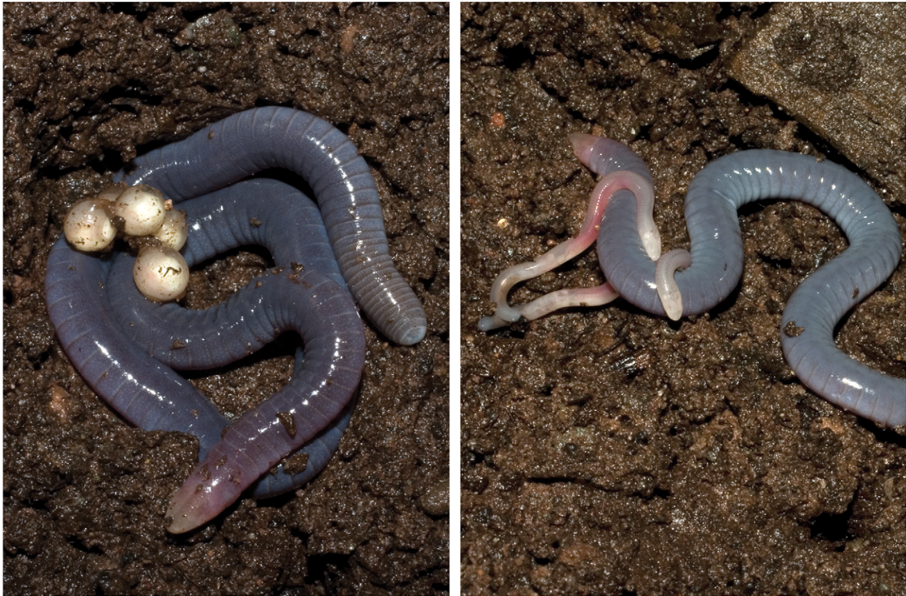
Figure 6. Reproductive mode of Microcaecilia dermatophaga sp. nov. Presumed mother with a connected string of five eggs (left) and with two hatchlings during the period of extended post-hatching parental care and maternal dermatophagy (right). doi:10.1371/journal.pone.0057756.g006

Pieces of what are presumed to be remnants of termite or ant mandibles are embedded in the skin of the head of some specimens; these are particularly clear and numerous in the slightly macerated MNHNP 2010.0190 (Fig. 4), and can be seen in live specimens, for example in BMNH 2008.721 (Fig. 5). BMNH 2008.721 has many scars on the body that were not present at the time of collection so that scaring must have occurred in captivity and presumably by intraspecific biting e.g., [7]. The distance between the choanae in this specimen is about twice the width of each choana. This is larger and also somewhat easier to judge than in the holotype because of the jaws having been forced open (Fig. 4).