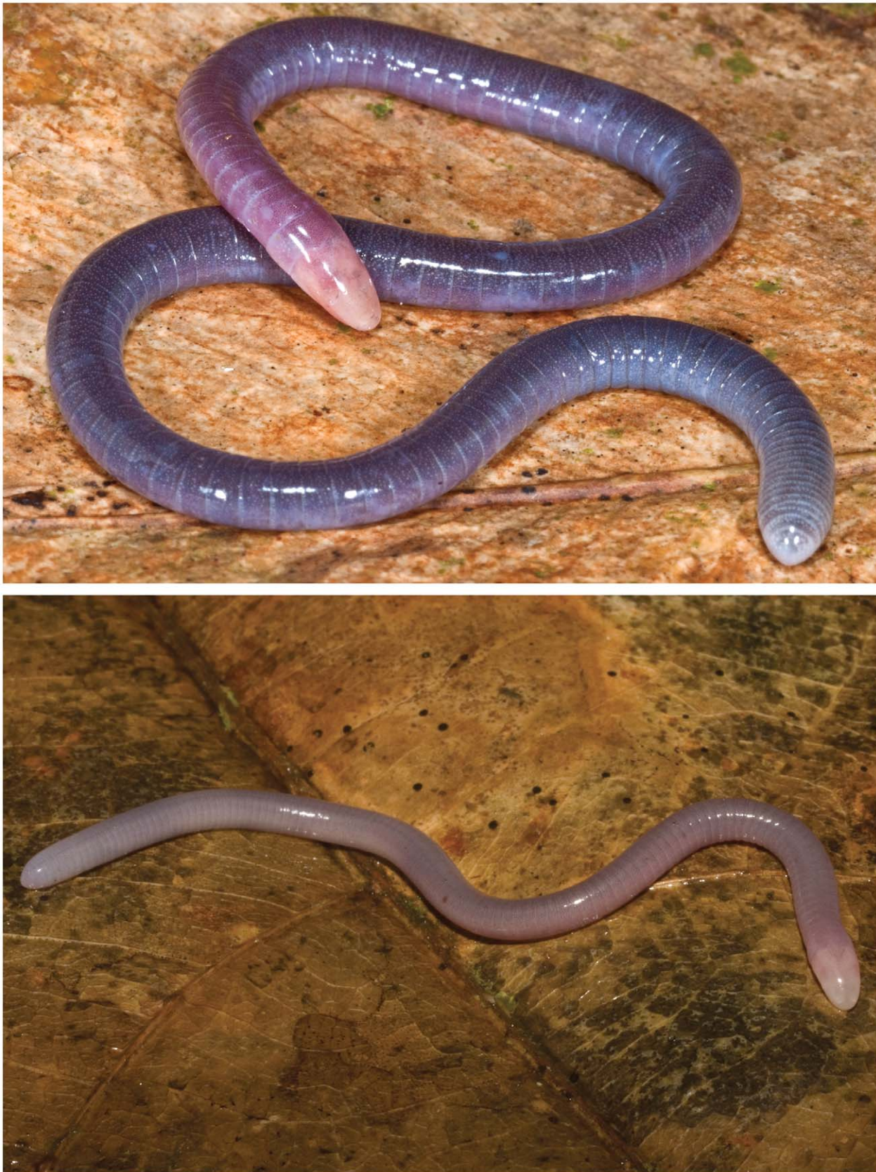
Figure 5. Adult and juvenile Microcaecilia dermatophaga sp. nov. in life. BMNH 2008.721 (top) and one of the three immature paratypes of Microcaecilia dermatophaga sp. nov. (bottom). doi:10.1371/journal.pone.0057756.g005