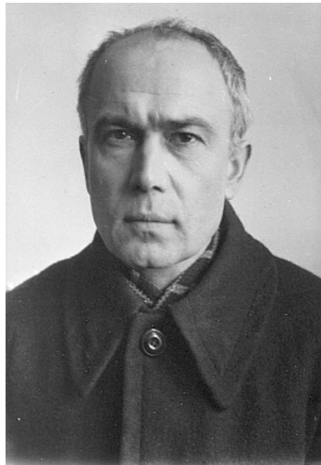
Fig. 4 Unidentified photograph, Father Maksymilian Kolbe , 1940