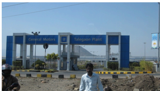
Figure 2.3: Industrial cluster in Talegaon