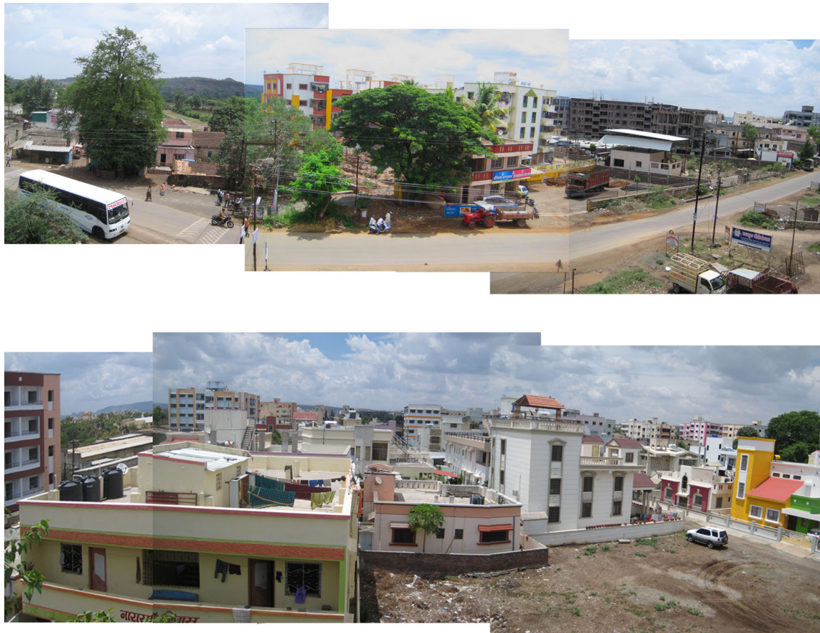
Figure 2.1: Views of Rajgurunagar Village Panchayat

It is a common sight to see apartment complexes being built in the midst of agricultural fields in these highway villages. As common a sight as the apartments are the billboards advertising these apartments, with flashy slogans that sell apartment ownership as a means to a “worldclass” urban lifestyle.