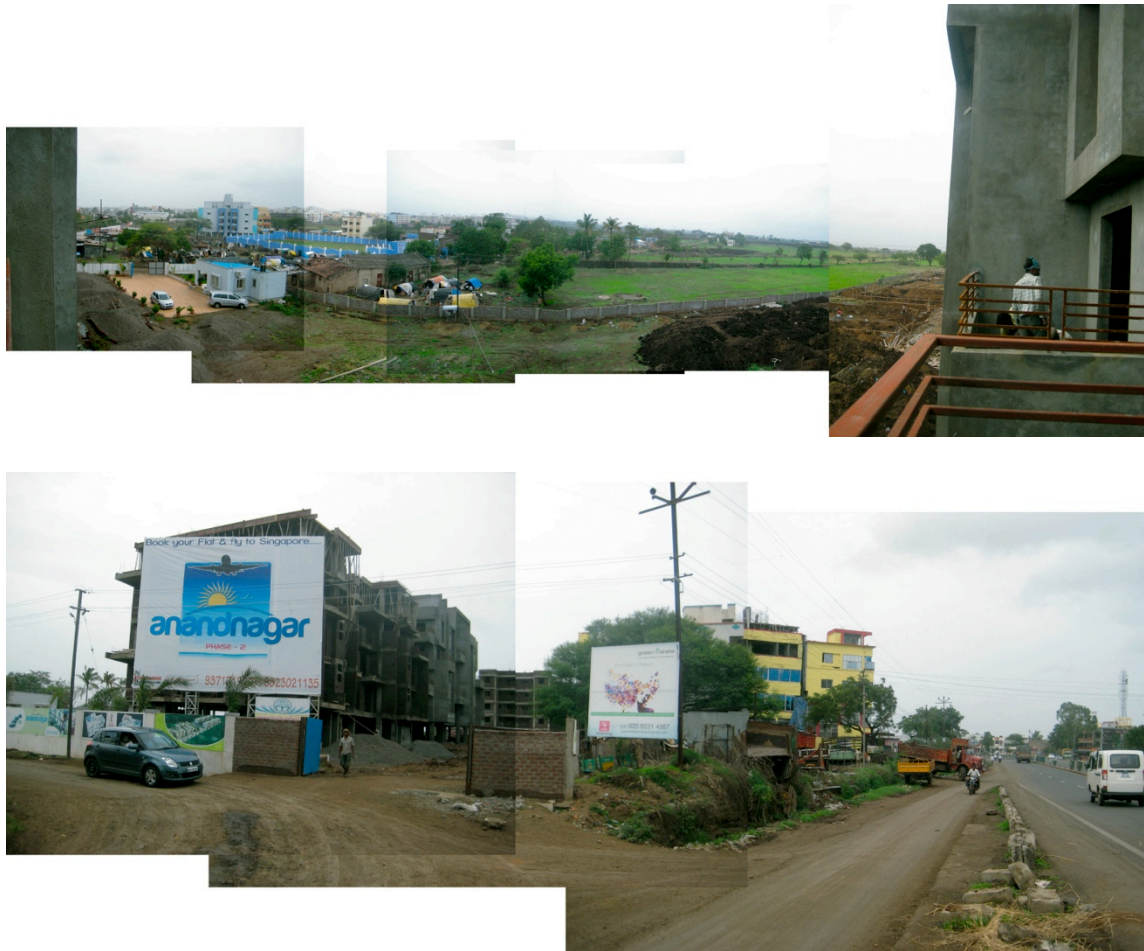
Figure 2.2: Apartments coming up in the midst of agricultural fields in Chakan. Chakan was the proposed location for the new Pune international airport, and the apartment advertisement reads: "Book your flat and fly to Singapore."