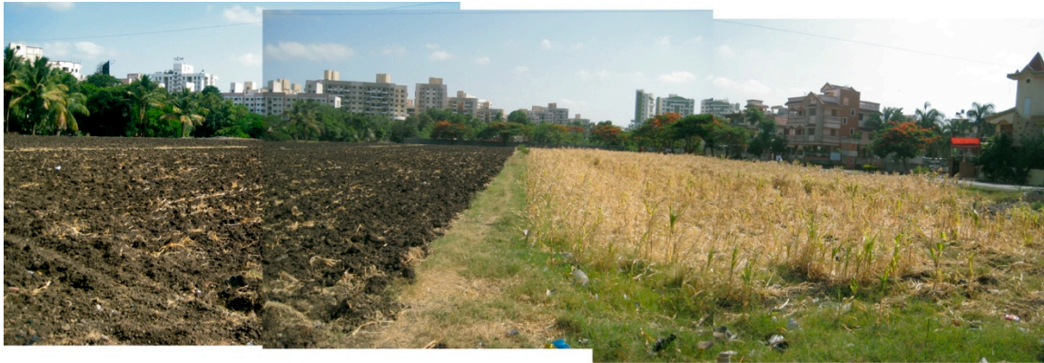
Figure 3.1: Sugarcane fields around Magarpatta Township waiting to be developed

This is how Magarpatta is marketed in its brochure “The Story of Magarpatta – The pride of Pune City,” with the aspirational subtitle “Life as it should be...” The completed and functional 400-acre Magarpatta City is a higher-income enclave of apartments, row houses, bungalows, food courts, information-technology (IT) complexes, school and 120 acres of gardens and lawns. A block from this dense urban environment of apartments and IT complexes, vestiges of the 1990s landscape remain in the few sugarcane fields surrounding Magarpatta City. These sugarcane growers, like the Magarpatta ones, have ambitions to be developers, but they are holding on to their plots, waiting for land prices to soar higher before starting their residential and commercial developments.