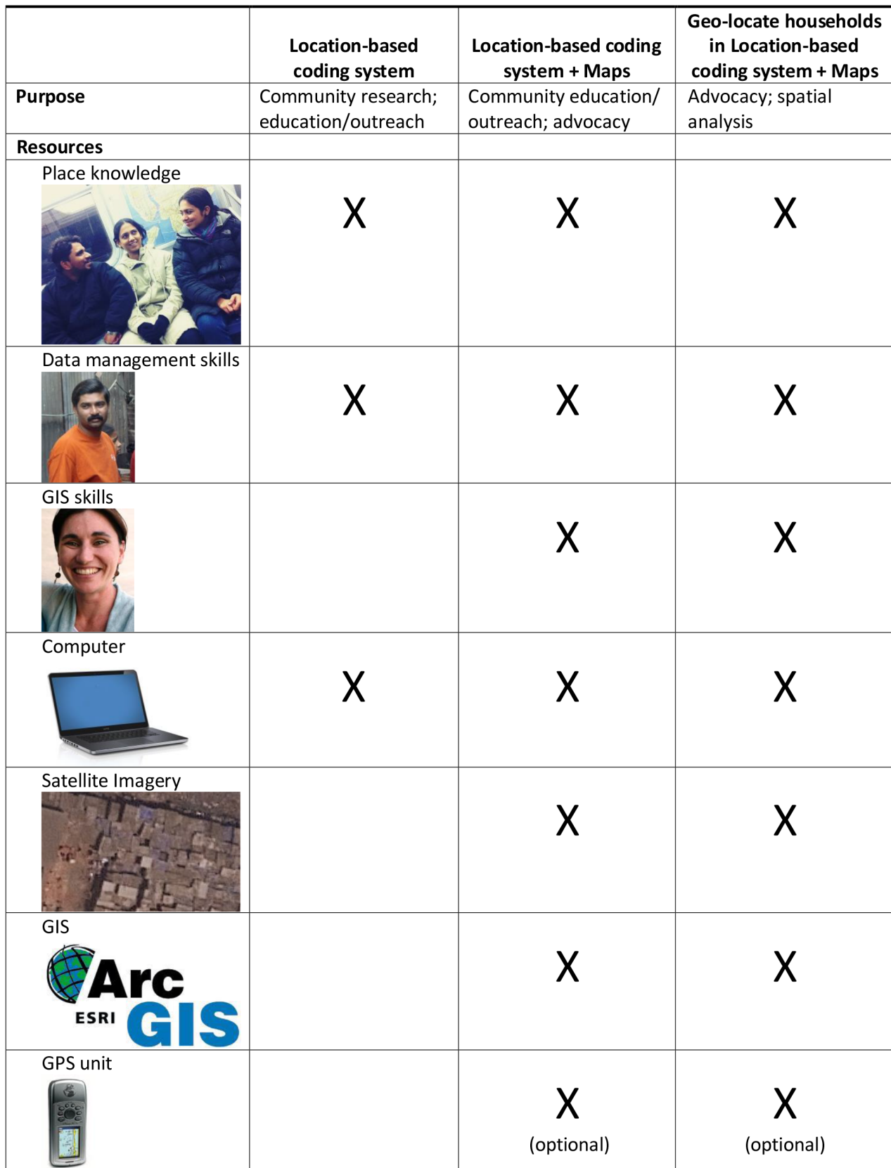
Figure 3. Location-based household coding system toolkit and applications.