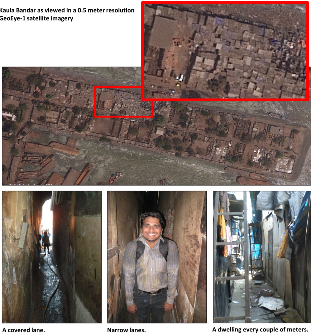
Figure 1. Kaula Bandar, Mumbai, India: A densely populated slum. doi:10.1371/journal.pone.0093925.g001

not receive GPS signals and they are not visible in satellite imagery. PUKAR researchers (authors SS, TS, KS) with extensive knowledge of the community mapped all lanes in a GIS with the help of a GIS student (author DT) using detailed satellite imagery and a few key GPS coordinates for reference. GPS coordinates were taken at the beginning and end of each main lane, and the satellite imagery provided additional cues about lane locations, such as “seams” over lanes formed by rooftops.