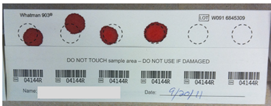
Figure 1. Dried blood spot sample. A collection card is shown with four, valid collected spots in the process of drying. Click here to view larger image.