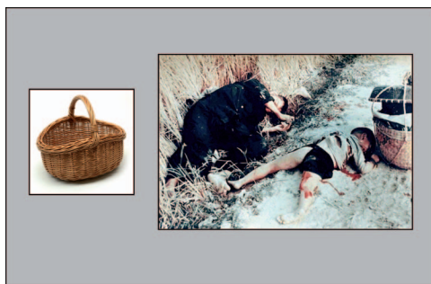
Figure 1. A representative cue–target pair, consisting of a negative scene and a neutral object that resembled an item embedded as a detail in its paired scene. Images are from the International Affective Picture System ( Lang et al., 2008 ) and from Brady et al. (2008) . See the online article for the color version of this figure.

Study phase. Participants studied each object–scene pair for 6 s (interstimulus interval [ISI] = 1 s). Test–feedback cycles followed, in which each object appeared for up to 4 s (ISI = 750 ms) and participants indicated, by pressing a button, whether they could recall the scene. If they could, three scenes appeared, and they had to select the correct one within 4 s. Foil scenes were