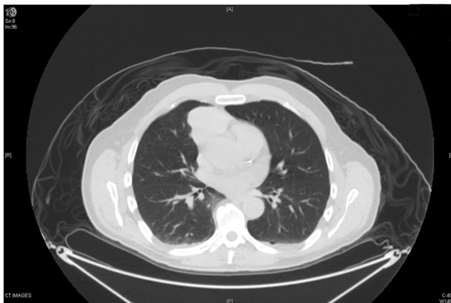
Figure 1 Axial section of initial CT scan with the anterior mediastinal mass abutting the pericardium.

(beta-hCG) serum levels were within normal limits; the patient’s serum and urine studies did not suggest syndrome of inappropriate anti diuretic hormone secretion (SIADH).