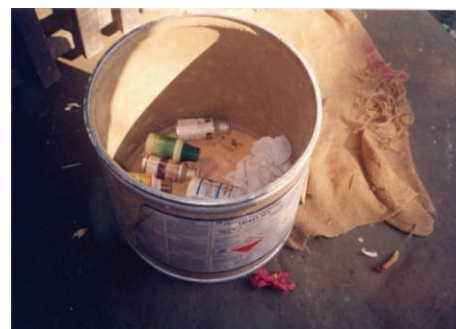
FIGURE 4: Pesticide in open container inside the cattle-shed (Amarabati village).

The farmers considered pesticides to be stored in a safe manner if they were kept out of reach of children but with little regard for the safety of other members of the family. Farmers added that it was impossible to keep pesticides in locked boxes or in a confidential place out of reach of other members of the family because they were sometimes actively involved in agricultural activities. Moreover, some farmers who were also involved in fishing said that another member of the family had to spray pesticides while they were away, and they had to know where the pesticides were stored. Although, most farmers are poor and cannot afford to purchase separate cupboards or locked boxes for storing pesticides, those who did have cupboards or locked boxes stored their pesticides along with other belongings such as clothes. Some farmers mentioned that, during the farming season, they are frequently required to spray pesticides, and it is inconvenient for them to store pesticides away in locked cupboards or