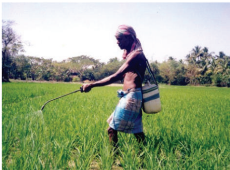
FIGURE 5: Farmers spraying pesticides in paddy field without protective gear (Namkhana village).