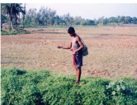
FIGURE 6: Farmer applying pesticides in vegetable field without protective equipment (Haripur village).

apparel (wearing garments, gloves, protective footwear, etc.) while spraying pesticides (Figures 5, and 6). Though many of farmers reported experiencing physical discomfort while using pesticides such as symptoms of nausea, irritation in the eyes and skin, they did not seek medical help. A common notion the farmers held was that drinking tamarind water would relieve nausea. A few farmers exhibited a nonchalant attitude when they declared that they opened the pesticide container with their mouth and some of them said they tasted it before applying it on the plants. These findings reflect their inadequate knowledge of pesticide hazards and the need to promote awareness of safe pesticide practice and storage. Studies on farm workers' knowledge about the effect of pesticide use conducted in Florida, North Carolina, USA, and Nueva Ecija, Philippines, Egypt, Turkey, and Malaysia reported similar findings [25–29].