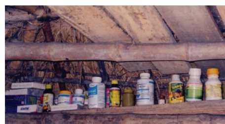
FIGURE 3: Pesticide kept under the roof in living room (Bagdanga village).

reported farmers store their supplies of pesticides within or near the household [3, 23]. However, most farmers preferred to keep the pesticides at home, in cartons, open shelves in the wall, or tucked away in a tile on the roof (Figures 2, 3 and 4). The reasons they cited were that most farmers were poor and some of them could not afford cupboards or locked boxes. Pesticides are expensive and hiding it in the agricultural field was considered to be unsafe as they may be stolen. Furthermore, rain water could seep into the container and render the pesticide unusable. While they expressed personal concerns about storing them in the fields, they totally ignored the environmental hazards such as soil contamination from spillage.