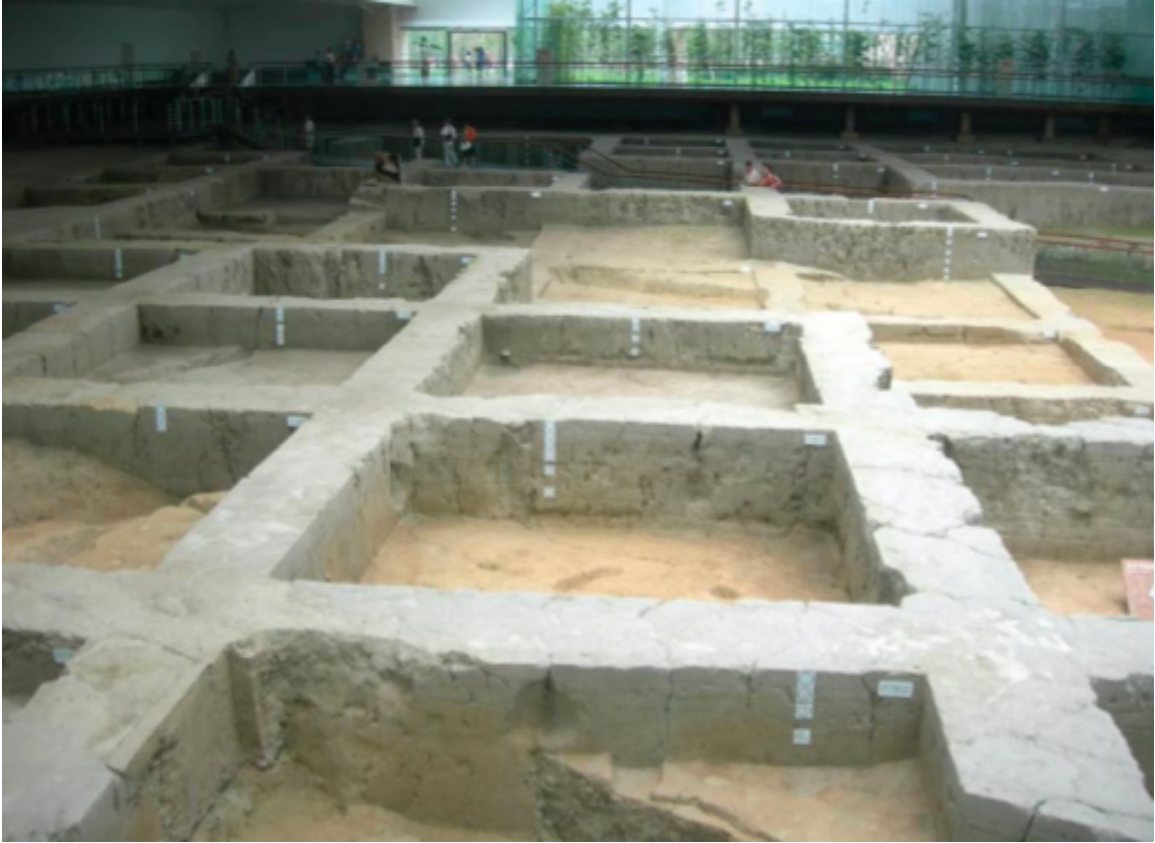
Figure 2: The site museum of Jinsha in Chengdu, Sichuan.