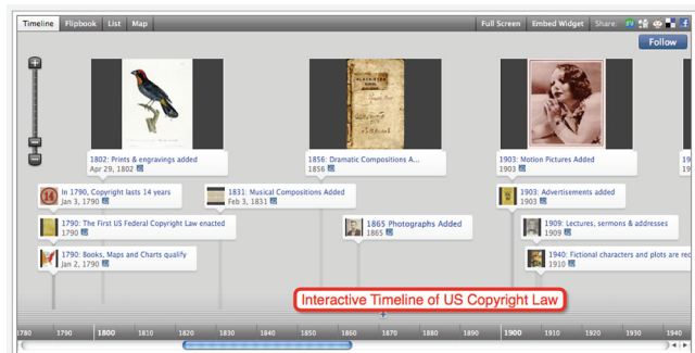
Figure 4 Interactive timeline of U.S. copyright law.

We have also created simple yet accurate legal definitions for copyright, fair use, permissions, the public domain, and Creative Commons. Embedded in these definitions are links to further resources, media links, and research tools. The legal definitions are primarily for teachers who wish to learn more about each topic and its related resources, but students are welcome to visit them as well.