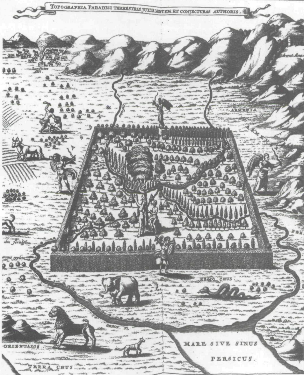
FIGURE 4: The Garden of Eden in Mesopotamia. From Athanasius Kircher, Arca Noë .

motivations for placing the Paleolithic on the other side of a gulf. Adopting the long chronology, after all, might invite the dangerous idea that political hierarchies emerged as the result of natural or Darwinian processes. To believe this would be to doubt the civilizing function of education, the blessing that is writing—even the beneficent role of academia itself.