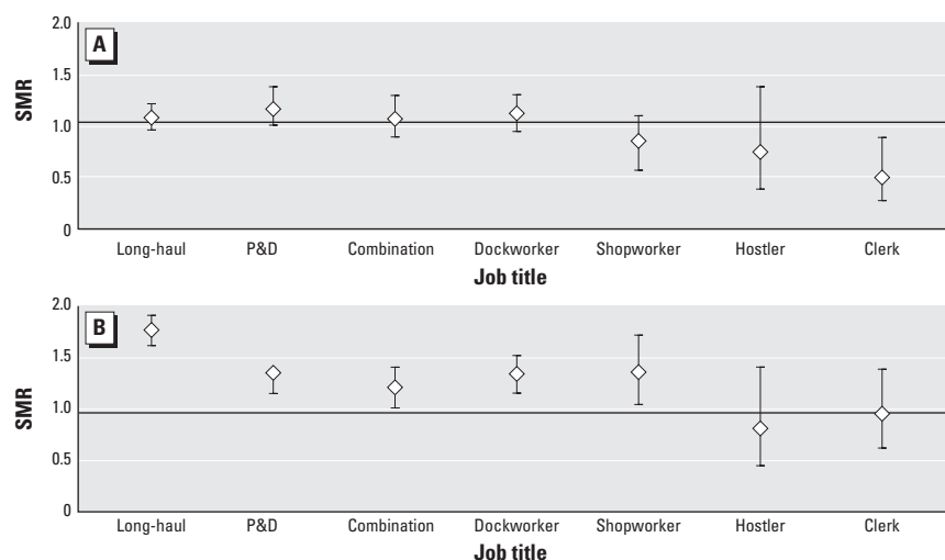
Figure 1. SMRs of lung cancer (A) and ischemic heart disease (B) by job title in the U.S. trucking industry compared with the general U.S. population. Error bars indicate 95% CIs.

Another potential limitation is the representativeness of these unionized workers to the rest of the U.S. trucking industry. Work practices among unionized companies are well-defined and the workforce is stable. It is possible that equipment-maintenance practices in these companies are more stringent than in the general trucking industry. However, there is wide variation even among our included companies, which has not been an important