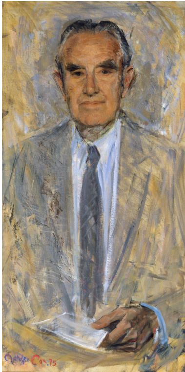
Fig. 2. William Averell Harriman by Gardner Cox, oil on canvas, 1975, National Portrait Gallery, Smithsonian Institution.