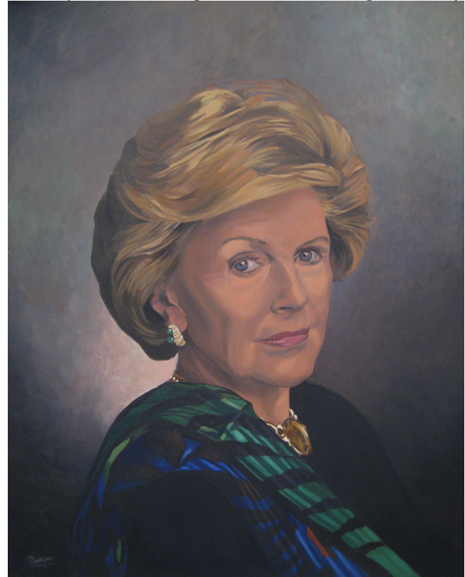
Fig 5. "Portrait, oil on canvas, 1996, of the 64 th US Ambassador to France, following Benjamin Franklin, 1996, by Anthony Palliser (1949-). The Honorable Pamela Digby Churchill Hayward Harriman was confirmed by the Senate in May 1993 and died in office on February 5, 1997."

Ambassador Harriman, the 'other nurse', died on the 5 th February 1997, following a stroke suffered the previous day