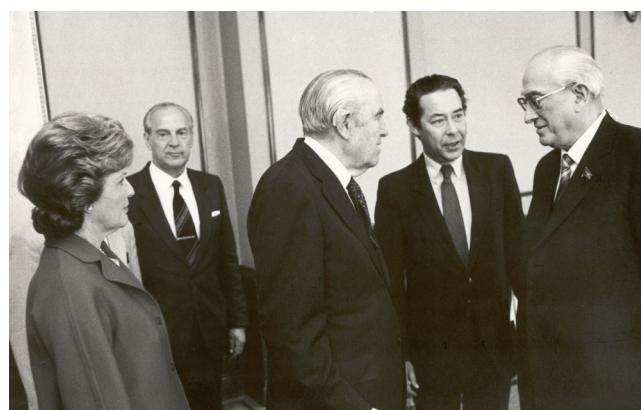
Fig 4. General Secretary of the Communist Party of the Soviet Union Yuri Andropov (right) greets Mr and Mrs Harriman on the 2 nd June 1983 in the Kremlin. From print in the W Averell Harriman Papers in the US Library of Congress, container 895.

Patient Harriman's father, Edward Henry, was described as "a