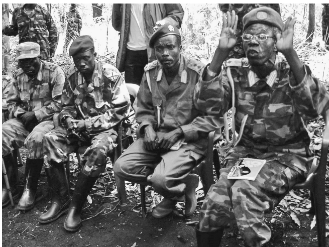
Figure 19.3 LRA Commanders, with Joseph Kony in center.

that the benefits it seeks are of a personal nature. That is, even the LRA's most public activities—such as village raids, abductions, attacks on the government's Uganda People's Defense Forces (UPDF) soldiers, and even peace negotiations—are oriented toward ensuring private ends.