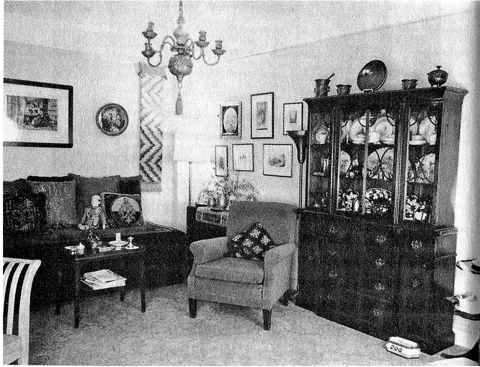
FIGURE 3. Ambros Adelwarth's living room. 333

Both of these domestic spaces appear in a book that thematizes emigration and exile and whose characters are never shown in an environment that resembles a home in the intimate Bachelardian sense. Instead of a place for imagining, these domestic spaces seem to be, at best, spaces for memory and, at worst spaces that stymie thought and feeling. In that context, it is not surprising that these homes are cold and lack in personality. However, when we consider the homes inhabited by Austerlitz, it is striking to see the same coldness present in two of the most important domestic spaces in the text – the house in Bala, where he lived with his adoptive family, and his own house in London.