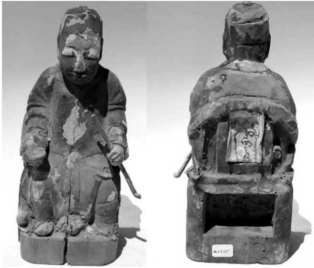
FIG. 1.—Front and back of Hunan statue (showing cavity).

commissioned the statue. If the names in this section of the consecration certificate are not of disciples of a particular religious master, then they are usually those of members of the same family and tend to include the names of the main patron (usually the father) and his wife, as well as of their sons (and their wives) and daughters. While many of the consecration certificates merely contain lists of names, some of them also contain short biographies. This may seem like a trivial point, but it is actually quite significant for those interested in genealogy, since in other historical documents women are hidden away—either through neglect or because they remain nameless. From one perspective, then, these images and their contents are what Michael Baxandall has termed “deposits of social relationships.” 46 The consecration certificate usually ends with the date of the consecration, the statue carver’s name, and in some cases a register of talismans (see fig. 2).