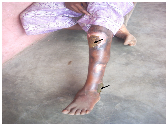
Figure 2 Herbal treatment for ulcers*.

*Respondent has had BU for more than 3 years and is being treated at home by his grandfather, a herbalist. Respondent's current condition is from recurring BU infections. The green patches (arrowed) are herbal dressings. Note the multiple scarring. Picture taken by Mercy Ackumey in the Otupaleam community, 2008.