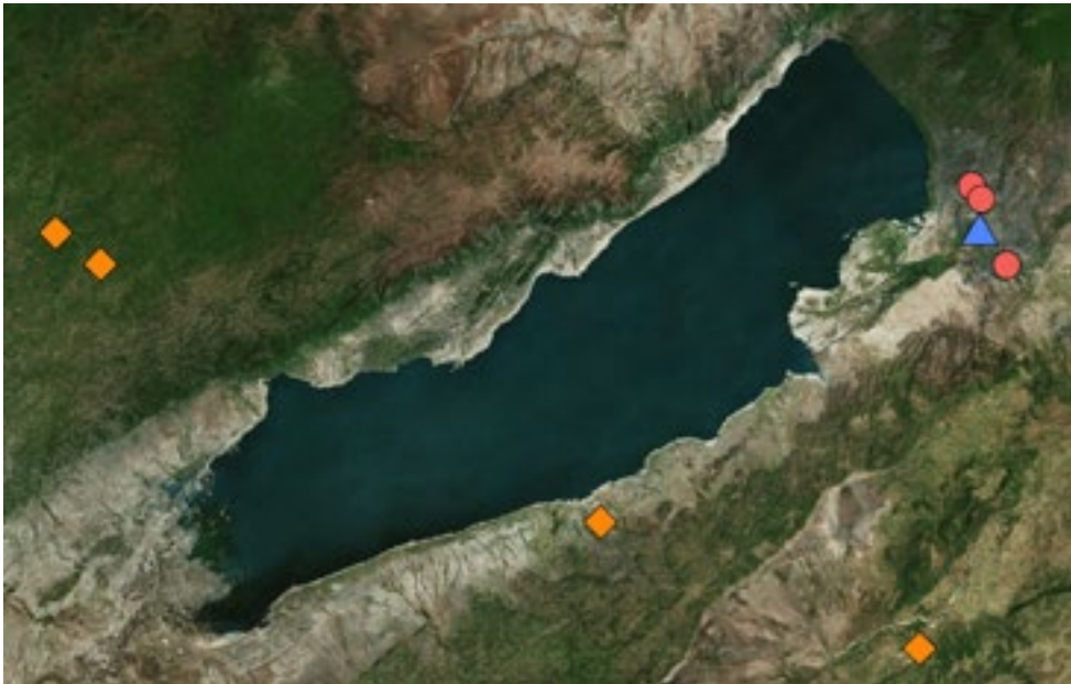
FIGURE 1. REGION INHABITED BY THE HADZA, AROUND LAKE EYASI

Notes: High exposure (HE) camps are marked with circles, and low exposure (LE) camps with diamonds. The triangle marks the Mangola village center.