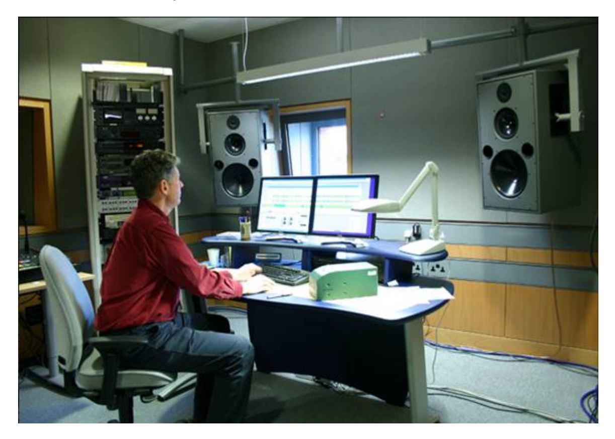
Figure 12. 'Floating' sound studio

The lower floor comprises mainly 'floating' studios to achieve the very high acoustic specification for audio preservation. The sound studios are built using block work, thermal and acoustic insulation and sit on reinforced concrete slabs 'floating' on acoustically isolating rubber pads some 600 mm thick. In addition to the ten sound transfer studios and a recording studio, there is storage for the many recording machines (many becoming obsolete) that the sound archive need to maintain and use. The studios are equipped with high performance machines for carrying out the studio's main focus of audio transfer. Analogue-to-digital converters aim to guarantee historic recordings are preserved but not modified and a precision-built audio analyser is used to test working equipment and ensure it meets exacting engineering standards set by professionals (<u>Ranft, 2007</u>). The studios prepare audio excerpts for playback in BL exhibitions and sounds for the BL website. One studio is used specifically for live recording of oral history interviews and lectures for the <u>BL's podcast programme</u>. A sorting area in the Technical Services office prepares collection items for copying and is equipped with a laboratory oven and bath for disc cleaning.