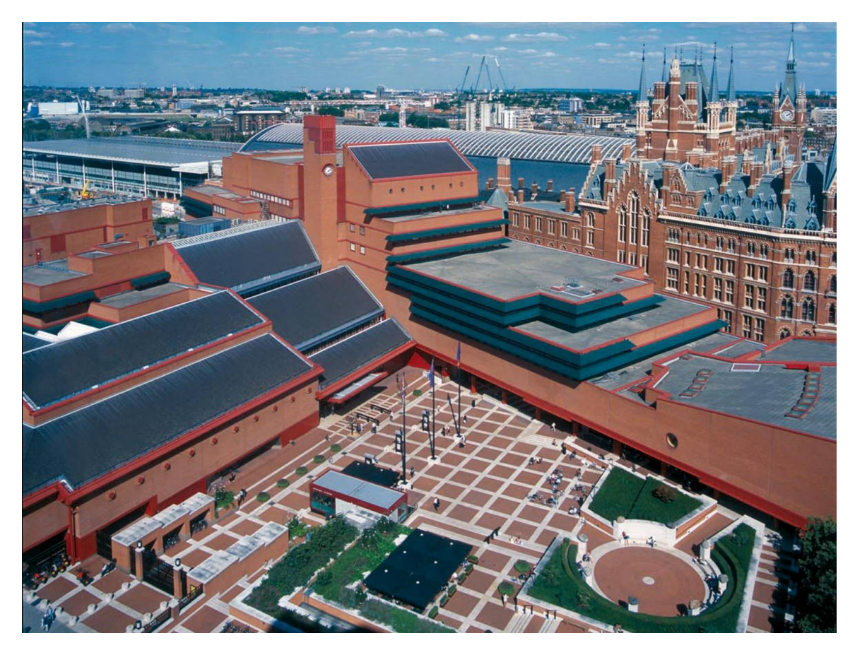
Figure 1. The British Library in the foreground with St. Pancras station behind