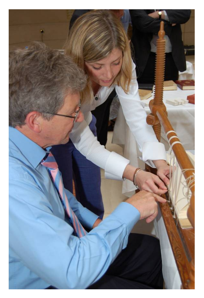
Figure 4. Demonstrating sewing a book at a travelling version of the exhibition