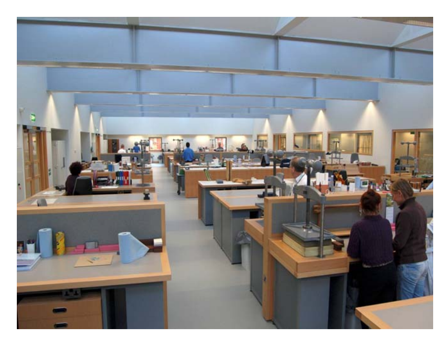
Figure 3. The main Book Conservation studios, around which there are weekly tours for the public

A Building as a Catalyst for Change: the New British Library Centre for Conservation