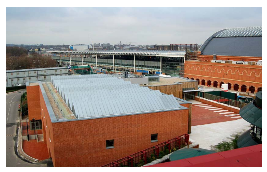
Figure 10. The new Centre for Conservation with saw-toothed roof