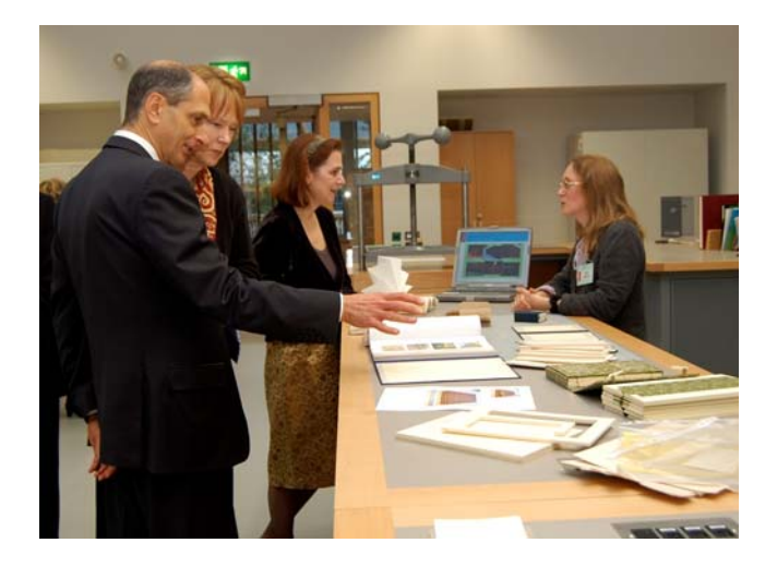
Figure 5. Visitors around the new Conservation studios

There is a programme of demonstrations, workshops and talks for the public on topics such as caring for photographs, family history archive days, as well as conservation advice clinics at weekends.