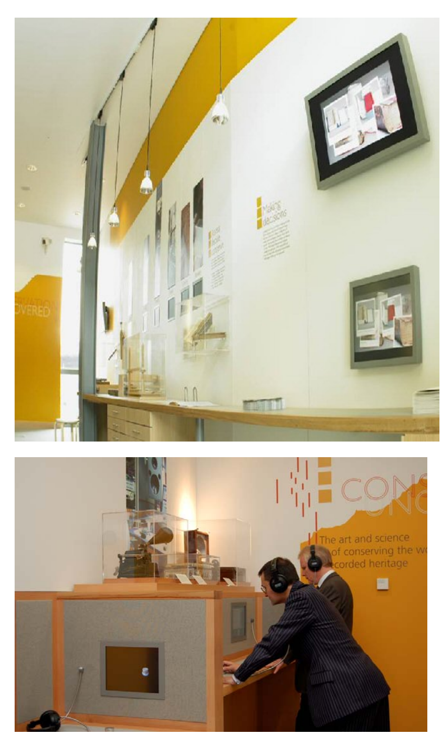
Figures 6, 7, 8. 'Conservation Uncovered': permanent exhibition in the entrance to the Centre with interactive displays on conserving books and sound