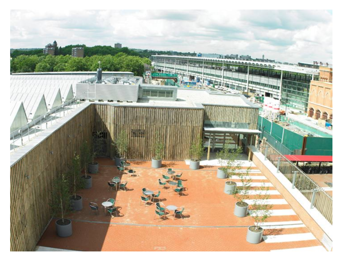
Figure 9. New public terrace joining the main building and the Centre with the new Eurostar station visible behind