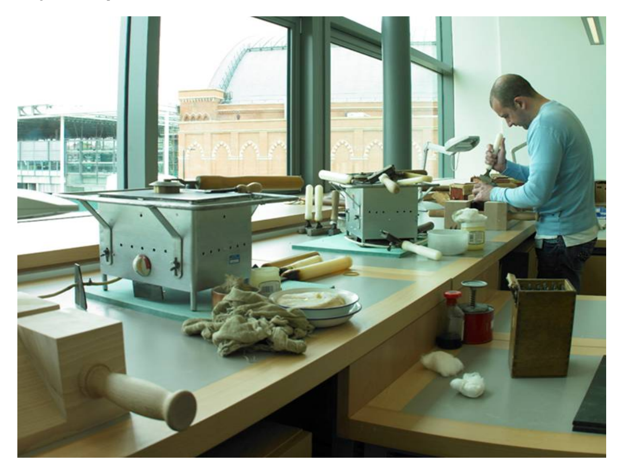
Figure 11. Separate gold finishing studios

In early discussions about having tours by visitors, the conservators had been concerned about feeling as though they were 'in a zoo'. To address these concerns, the studios cannot be looked into directly from the public terrace. Panelled in American oak that will turn silver in time, there are windows in the exterior walls overlooking the terrace but they have been offset to negate any 'zoo-like' feeling. There is a distinct space for gold tooling and finishing. Tooling books in gold leaf is very visual and popular with visitors. The BL has some of the few people in the country skilled in finishing and gold tooling. The studio layout and benches were designed to incorporate demonstrations.