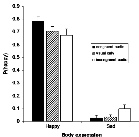
Fig. 2 Proportion 'happy' responses as a function of body expression and auditory information. Error bars represent 1 SEM

The results are displayed in Fig. 2. We calculated the proportion happy responses for every condition in every