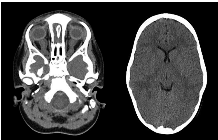
Fig. 3. Brain and orbital CT scan. The left image shows enlargement of optic nerve sheaths secondary to papilledema. The right image illustrates ventricular narrowing and near absence of cerebrospinal fluid space.