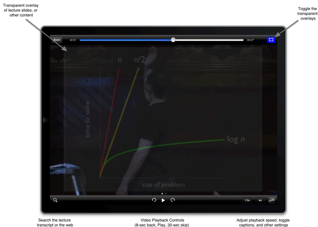
Figure 2: CS50 Video's iPad player offers an immersive experience in which students can view overlays with supplementary material as well as search transcripts and the web.

questions were recorded across 35 videos; 61.3% of these responses were correct answers. Although the semester is still in progress, we were disappointed with some of these early results, particularly the relatively low percentage (28%) of students who've engaged with CS50 Video's interactive assessments. Vis-à-vis alternative players, it is possible we overcorrected with CS50 Video's design, placing too much control in students' own hands, whereby it is now too easy to overlook available questions. At the same time, we suspect students might not perceive sufficient value in answering questions, given that responses are recorded but not graded for credit. We intend to experiment further with alternative interfaces that might lend themselves to more active engagement.