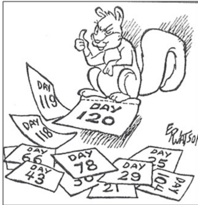
Figure 7. Elwood Watson, Jr., "Judge delays construction of Arizona Observatory," The Scientist . 30 April 1990.

In March 1990, the long-anticipated judgment in the SCLDF lawsuit against the U.S. Forest Service, the USFWS, and UA was made by the District Court in Tucson. On the day of closing remarks, U.S. District Judge Alfredo C. Marquez asked UA attorney David C. Todd of Patton, Boggs, & Blow if it would be possible to stop construction if the monitoring program ultimately revealed that the observatory would lead to the squirrel's extinction. Todd's reply was that if it was later determined that construction "was going to kill every squirrel," nothing could be done about it because Congress had already approved the project. 230 In a move that was widely viewed as an environmentalist win, Marquez then granted a 120-day injunction against telescope construction due to the questions that had been raised during the case about the USFWS BO and the AICA exemption from the ESA (see Figure 7).