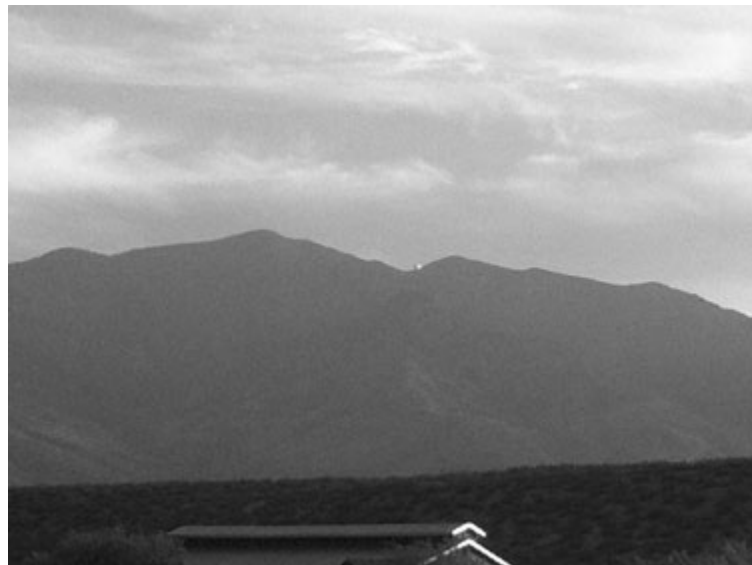
Figure 10. The Large Binocular Telescope (LBT).