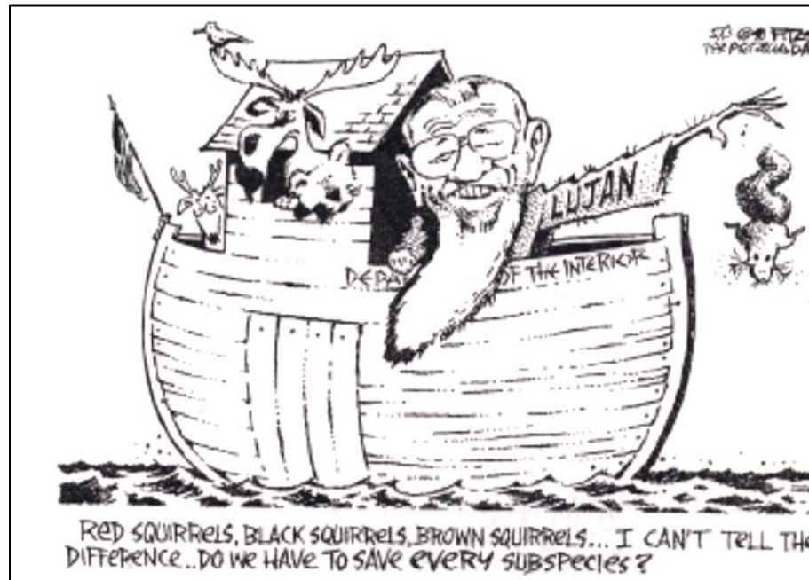
Figure 8. David Fitzsimmons, “Red squirrels, black squirrels, brown squirrels...I can’t tell the difference,” The Arizona Daily Star . 13 May 1990.

wondered, “do we have to save every subspecies?” 239 Lujan’s direct reference to the Mt. Graham Red Squirrel in the context of weakening the ESA was immediately ridiculed by the press (see Figure 8).