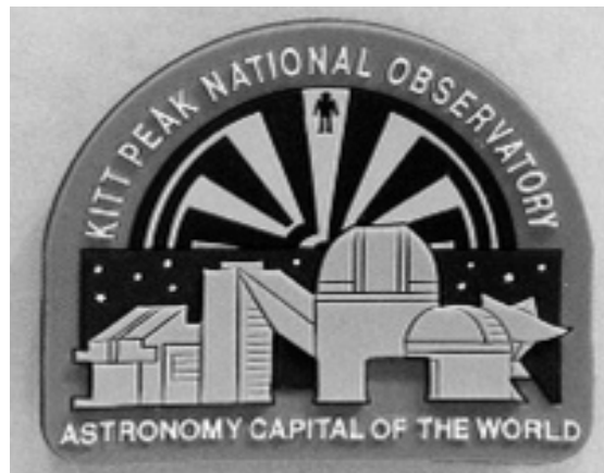
Figure 1. KPNO magnet showing ‘man in the maze’ and major observatories at Kitt Peak.

patrons to “...make sure you stop by and check out some of our unique items from Tohono O’odham crafts (which we are known for) to astronomy education items.” 180 Leaving the gift shop with a telescope and a hand-woven basket featuring the O’odham’s creator I’itoi after chatting with a member of the O’odham Nation, a visitor to KPNO is made to feel that both astronomers and the O’odham are equally represented on the mountain.