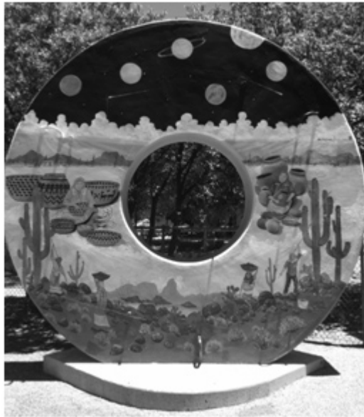
Figure 3. KPNO Visitor Center mural.

A plaque is mounted on a large boulder with the O’odham’s “man in the maze” symbol, which is both a metaphor the O’odham use to urge seeking meaning in life as well as a depiction of I’itoi’s path from Baboquivari Peak to the Tohono O’odham. 182 Another tribute to the O’odham is found in the visitor parking lot, where Fedele commissioned a Tohono O’odham artist to paint a large circular mural on an old telescope mirror blank. Showing scenes of O’odham harvesting the fruit of the saguaro cactus for the Nawait i’i (Rain Ceremony) and making basket and pottery under a starry sky dotted with planets (see Figure 3), the mural’s symbolism is unmistakable: in this place, traditional O’odham ceremonies and practices are intimately wedded to astronomical culture.