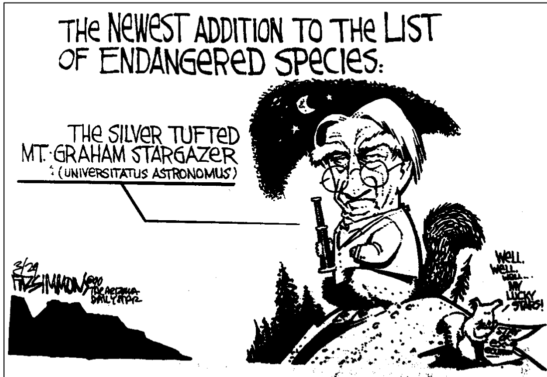
Figure 5. David Fitzsimmons, "The Newest Addition to the List of Endangered Species," The Arizona Daily Star . 29 March 1987.

Peak would be less detrimental to the red squirrel's habitat, but this recommendation was most unwelcome to UA astronomers because High Peak could not accommodate as many telescopes as Emerald Peak. 116