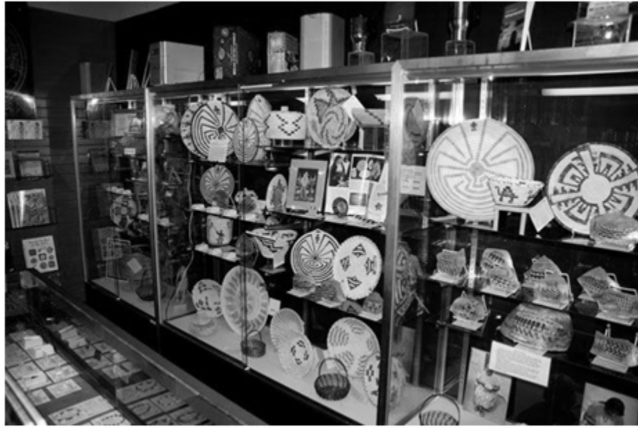
Figure 2. “O’odham Baskets.” Glass cases at KPNO Visitor Center Museum and Gift Shop displaying Tohono O’odham baskets. Astronomy books and stargazing kits are visible on top of the cases and along the wall.

that can form around joint astronomy-and-O’odham related ventures. 181 Just outside the Visitor Center, there are other telling signs of attempts by Fedele and his predecessors to incorporate the O’odham into the visual landscape of the observatory.