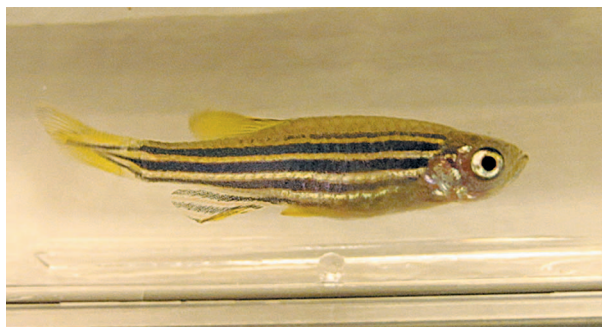
Figure 2. The zebrafish, Danio rerio , is an important vertebrate model organism in eye research.

photoreceptor activity in the larval fish.