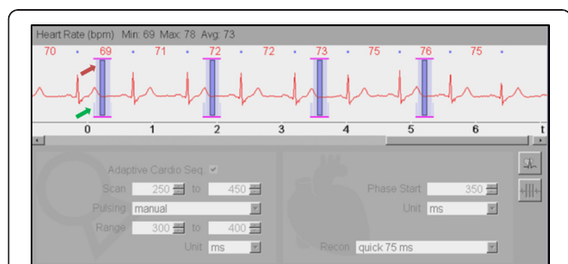
Figure 1 ECG strip demonstrating timing of image acquisition.

Volume CT dose index (CTDI vol ) and dose length product (DLP) for the CTA scans were recorded and effective dose was calculated [12].