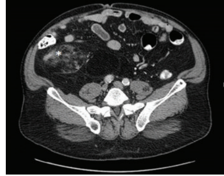
FIGURE 2: CT abdomen and pelvis with IV contrast, transverse image, displaying a large fatty lesion with associated soft tissue component (starred) in the right peritoneum anterior to the iliopsoas muscle. There is displacement of the bowel loops anteriorly and to the left.

large, retroperitoneal well-differentiated liposarcoma which extended through the right inguinal canal.