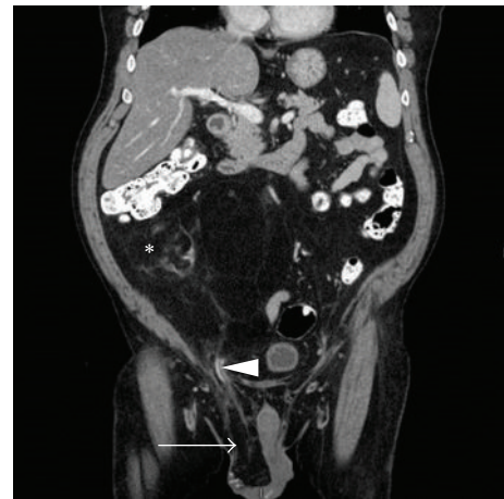
FIGURE 3: CT abdomen and pelvis with IV contrast, coronal image, demonstrating a large fatty lesion with associated soft tissue component in the right peritoneum extending into the right lower quadrant along the right paracolic gutter measuring 10.3 \times 7.4 cm and 18.1 cm in superior to inferior direction. The lipomatous lesion extends into the inguinal canal (white arrowhead) resulting in right-sided inguinal hernia (white arrow). There is an area of ill-defined soft tissue component (starred). Bowel loops are displaced to the left.

The white arrow on Figure 3 highlights the right-sided inguinal hernia contents, which have the same homogenous hypointensity as the large fatty lesion in the retroperitoneum. The liposarcoma had likely extended through the inguinal rings resulting in indirect inguinal hernia appreciated on physical exam. Indicated by the white arrowhead in Figure 3, a section of the right gonadal vein courses through the deep