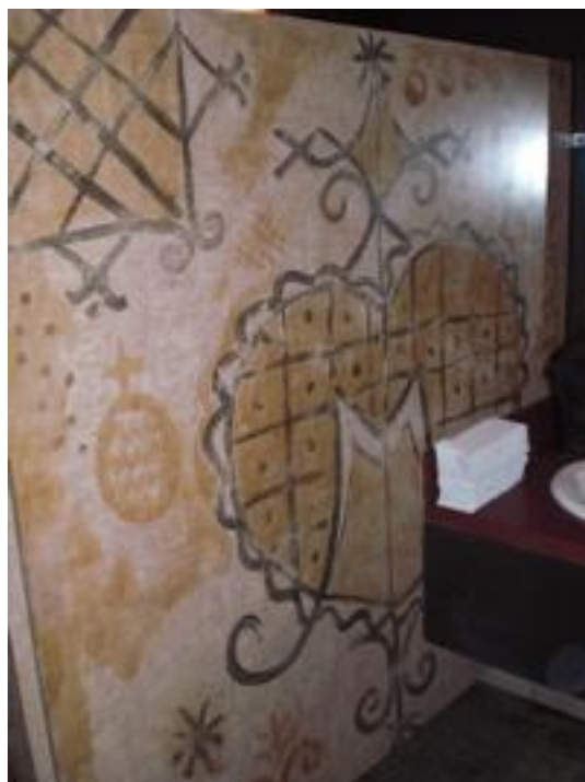
Figure 1.2: Vèvè painted on a toilet stall of Muriel's, New Orleans, LA. The ornate heart is a vèvè for the spirit Ezili Freda.