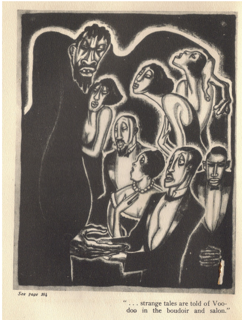
Figure 4.1: "... strange tales are told of Voodoo in the boudoir and salon." Illustration by Alexander King for Seabrook's The Magic Island .