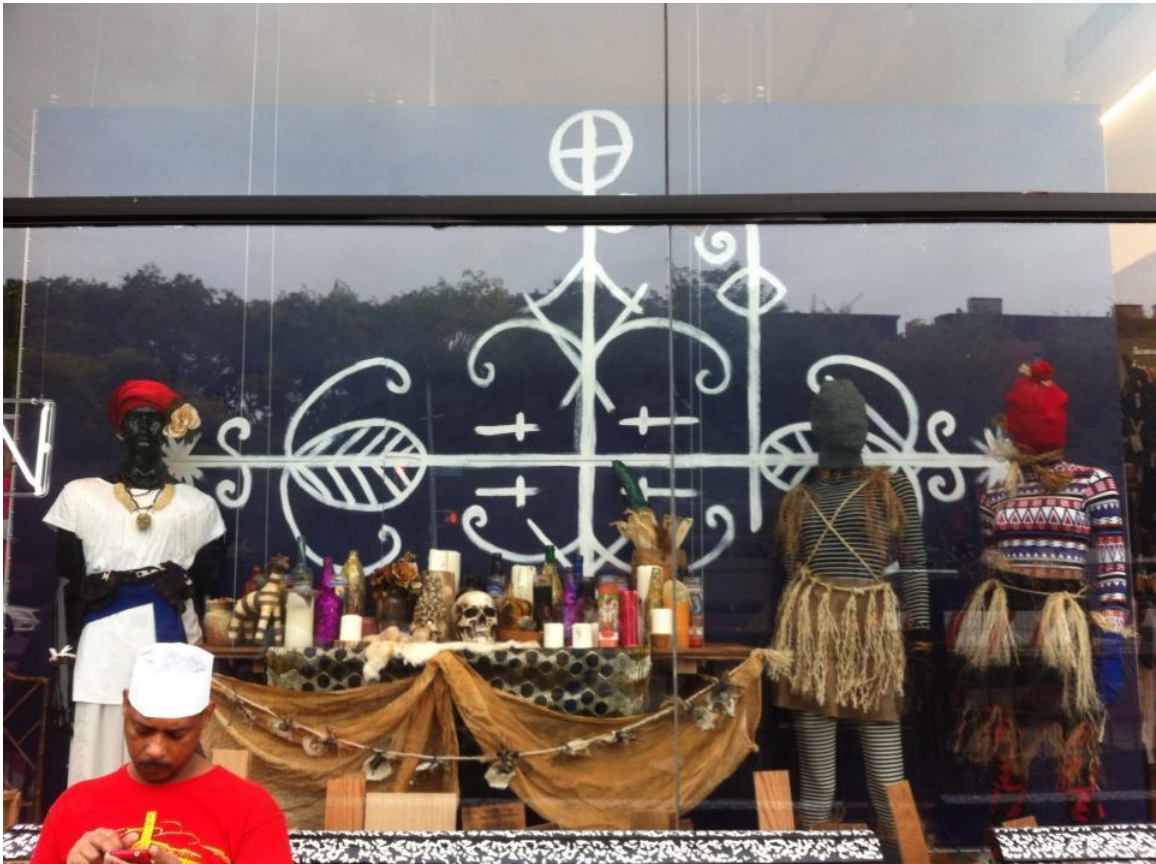
Figure 1.3: American Apparel Halloween “voodoo” window display Houston Street, New York City. Early October, 2013.

The display has manikins dressed in voodoo costumes in front of a voodoo altar. On the background wall, a version of the vèvè for Papa Legba has been painted.