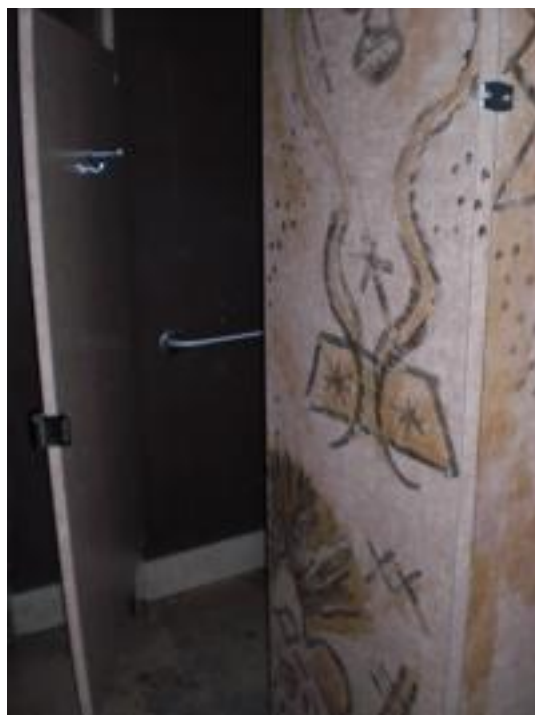
Figure 1.1: Vèvè painted on a toilet stall of Muriel's, New Orleans, LA. The top half is a distressed (and distressing) depiction of a vèvè for the spirit Danbala Wedo.