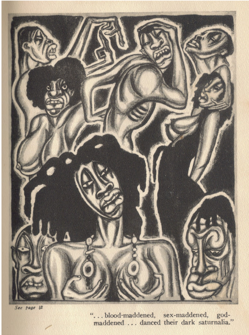
Figure 3.1: Illustration by Alexander King from Seabrook's The Magic Island