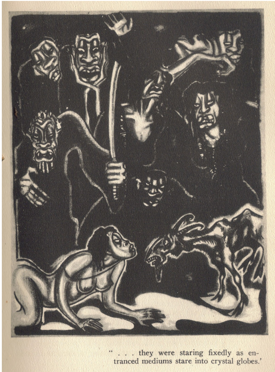
Figure 3.2: Illustration by Alexander King from Seabrook's The Magic Island