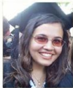
Person 1 (Press 1)