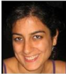
Person 2 (Press 2)