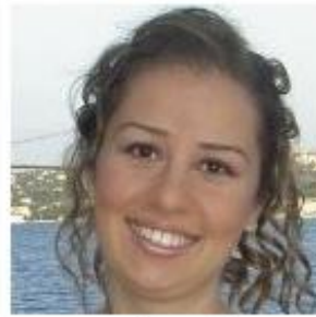
Person 3 (Press 3)