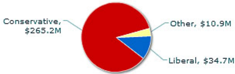
Figure 1: Reported Spending by Organizations with No Donor Disclosure, 2012

organizations that reported spending more than $1 million on political advertising in the last campaign, 20 were conservative groups, which spent a total of $204 million; seven were liberal groups, which spent $33 million; and one was independent. 64 The 501(c)(4)s account for the bulk of all spending by groups that do not disclose donors, for which 2012 totals are as follows: