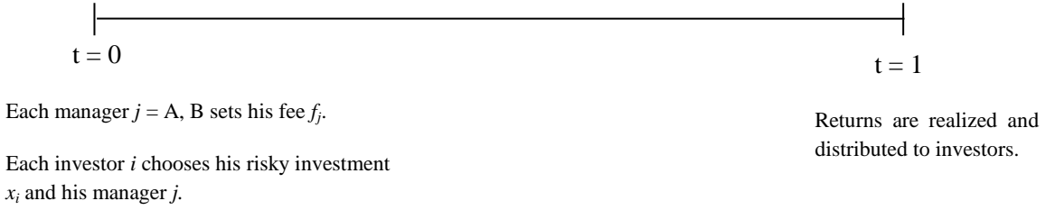
Figure 1. Timeline.