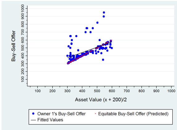
Figure 1: IO