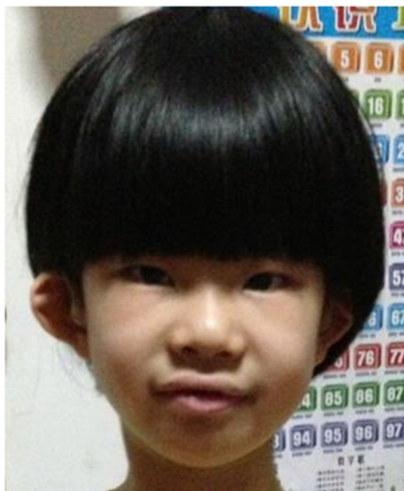
Figure 1 The dysmorphic facial features of case 1 with de novo 8q13.2-13.3 microdeletion. Low-set ears with an asymmetrical, cup-shape on the left and preauricular pits near the right ear (black arrow), and bilateral hearing loss.