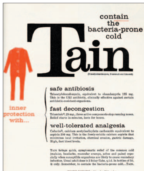
Figure 4. A 1960 Advertisement for Tain.

The combination antibiotic Tain was advertised for the treatment of colds, which by the early 1960s was already considered inappropriate by infectious disease experts.