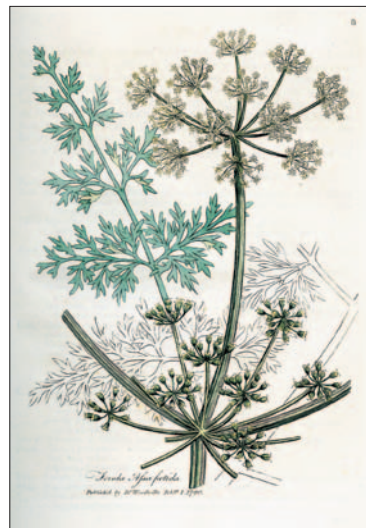
Figure 2. The Asafetida Plant.

Yet doubt and diversity were on the rise. Boston soon became home to a skeptical practice style that directly disparaged Rush’s heroic approach. Even in the Journal ’s first issue, Jacob Bigelow critiqued the varied rationales justifying existing treatments for burns and appealed for empirical evidence to support the “ negative mode of treating burns, which should