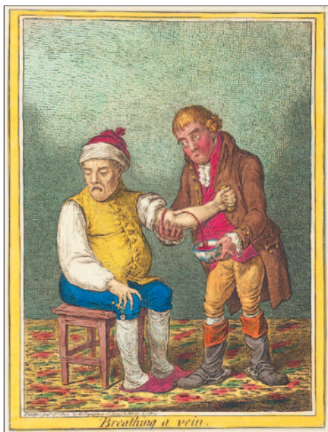
Figure 1. Bloodletting in the Early 19th Century.

This caricature by James Gillray (1757–1815) illustrates the common practice of bloodletting (“breathing a vein”) to help cure disease. (Published by H. Humphrey, St. James’s Street, London, January 28, 1804.)