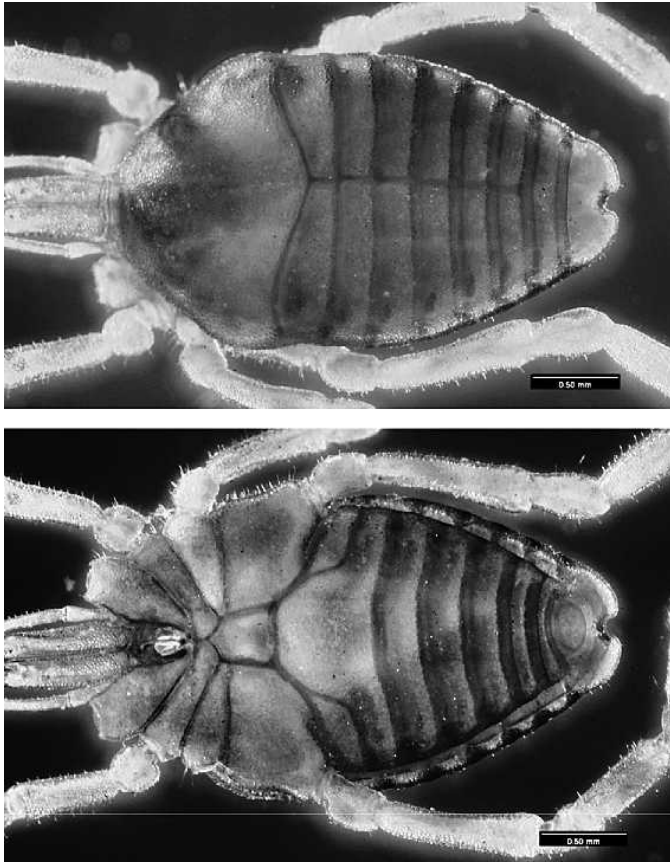
Figure 2.—Holotype of Pettalus brevicauda in dorsal (top), and ventral (bottom) views. Scale bar = 0.5 mm.

typical of immature specimens. Although we visited Pundaluoya in June 2004, we were not able to locate primary forest, and we did not locate specimens of Pettalus in the tea plantations. In 2001 I received a loan from NHM supposedly containing the types of both species. However, both specimens, a large male and a much smaller subadult male, were labelled in pencil and using the same font as " Pettalus brevicauda " from "Pundulooya" collected by E.E. Green.