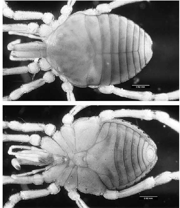
Figure 3.—Specimen of Pettalus sp. from Pundaluoya in dorsal (top), and ventral (bottom) views. Scale bar = 0.5 mm.

After a second visit to the collections of the NHM in June 2007, I was able to examine a third Pettalus specimen, also labelled as " Pettalus brevicauda , Poc. (young), Pundulooya (Ceylon), E.E. Green coll." and solve the mystery about the identity of the two oldest Pettalus species. In total, the NHM collection included three specimens of Pettalus illustrated in Figs. 1–3. The largest specimen (5 mm measured in dorsal view from anteriormost carapace border to end of the "tail," as is currently the standard for measuring Cyphophthalmi), an adult male, is unmistakably the holotype of P.