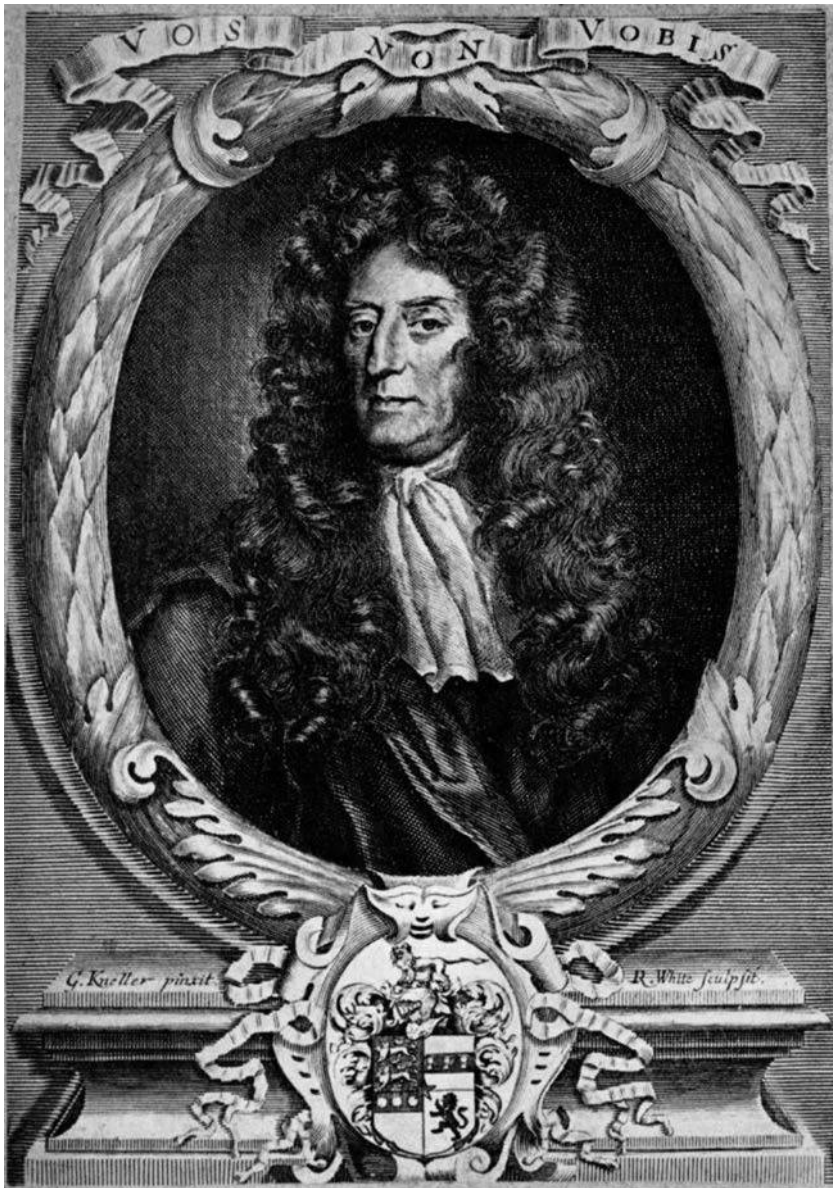
Figure 3. Roger L'Estrange, by Robert White, after Sir Godfrey Kneller, line engraving, published 1692. A color version of this figure is available online.