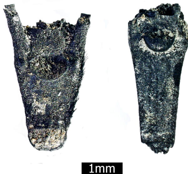
Fig 3. Wild-type (left) and domestic-type (right) scars in rachises of wild barley ( Hordeum spontaneum ) from Ohalo II.

We suggest that the Ohalo II archaeobotanical remains indicate that the locals practiced small-scale cultivation, with no evidence for its continuation in the following period. Similar failed