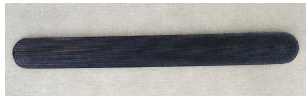
Fig. 4. Tongue depressor printed by FDM. Material used: acrylonitrile butadiene styrene. Cost: 5 cents per gram.

ciated with various conditions than can be achieved with traditional visualization tools. 12–14 Furthermore, they can be used to simulate in vivo conditions