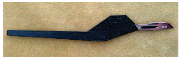
Fig. 2. Scalpel handle printed by FDM. Material used: acrylonitrile butadiene styrene. Cost: 5 cents per gram.