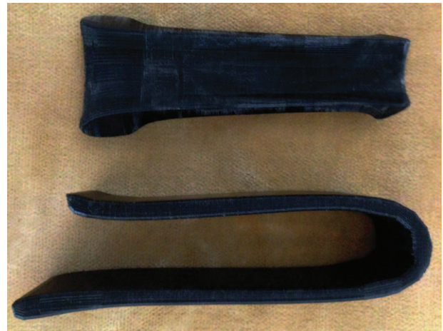
Fig. 3. Splints printed by FDM. Material used: acrylonitrile butadiene styrene. Cost: 5 cents per gram.