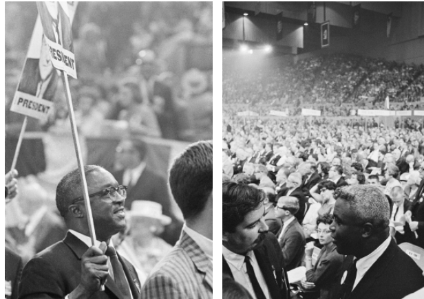
Two prominent African American delegates at the GOP convention in July 1964: Clarence Townes (left) and Jackie Robinson (right).

The bitterness between black party members and Goldwater Republicans continued to fester, with relations finally reaching a breaking point in mid July at the Republican National Convention. Arriving at the Cow Palace in San Francisco, black Republicans were unsettled by the chants of 50,000 anti-Goldwater protesters, and disheartened to discover that there were only 43 African American representatives—15 delegates and 28 alternates, or approximately 1 percent of the total convention body. The representa-