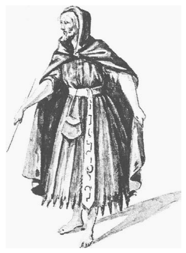
Fig. 1: Witch's costume

Scotland. By 1847 Verdi had developed a specific style for epigram: a way of thickening a terse melody into a sort of stage-object, something to be wielded, just as a character might wield a sword. Conspicuous examples can be found in Ernani (1844), in the rhyme that commands Ernani's suicide, or in Attila (1846), when Attila dreams of a huge old man who bars his path to Rome, saying: