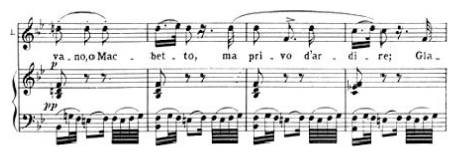
Ex. 12: parody

Lady immediately quotes this tune back to him, suggesting that the phantom voice was really saying 'Sei vano, o Macbetto, ma privo d'ardire' ('you are vain, O Macbeth, but not bold enough') (Ex. 12).