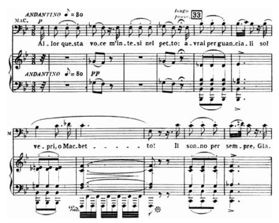
Ex. 11: Only thorns for a pillow

song. When Verdi in 1875 compared his achievement to Wagner's, he noted, 'I, too, have attempted the fusion of music and drama . . . and that in Macbeth '. <sup>23</sup> Verdi hadn't yet written Otello or Falstaff , but in those late operas he approached Shakespeare through the highly wrought, semi-opaque medium of Boito's poetry and dramaturgy, whereas Piave provided a fairly clear image of the original Jacobean text.