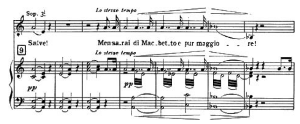
Ex. 3: Prophecy to Banquo

is a i-V half-cadence, a very simple thing; in the construction manual of opera, this isn't much more than a standard-issue brick; but Verdi shows great resourcefulness in promoting this little cadential chunk into the rawest element of horror, the Mark of Cain itself.