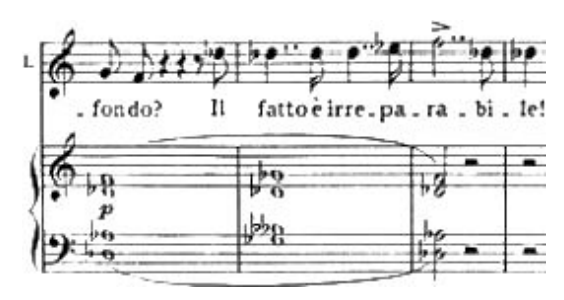
Ex. 7: Irreparable deed