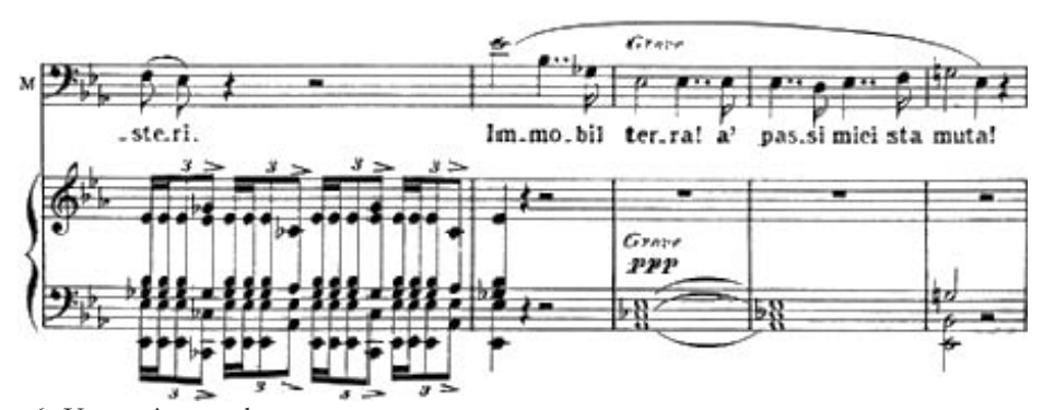
Ex. 6: Unmoving earth

enters – Lady asks him when the king will be leaving, and he replies 'Domani' ('tomorrow'); this news inspires her to devise a memorable omen: 'Mai non ci rechi il sole un tal domani' ('may the sun never bring us such a tomorrow'), her vocal line inching up the first fifth of the C minor scale, then falling back from G to E \, \flat , with a plagal cadence in the orchestra ( E \, \flat - A \, \flat - E \, \flat major) (Ex. 5).