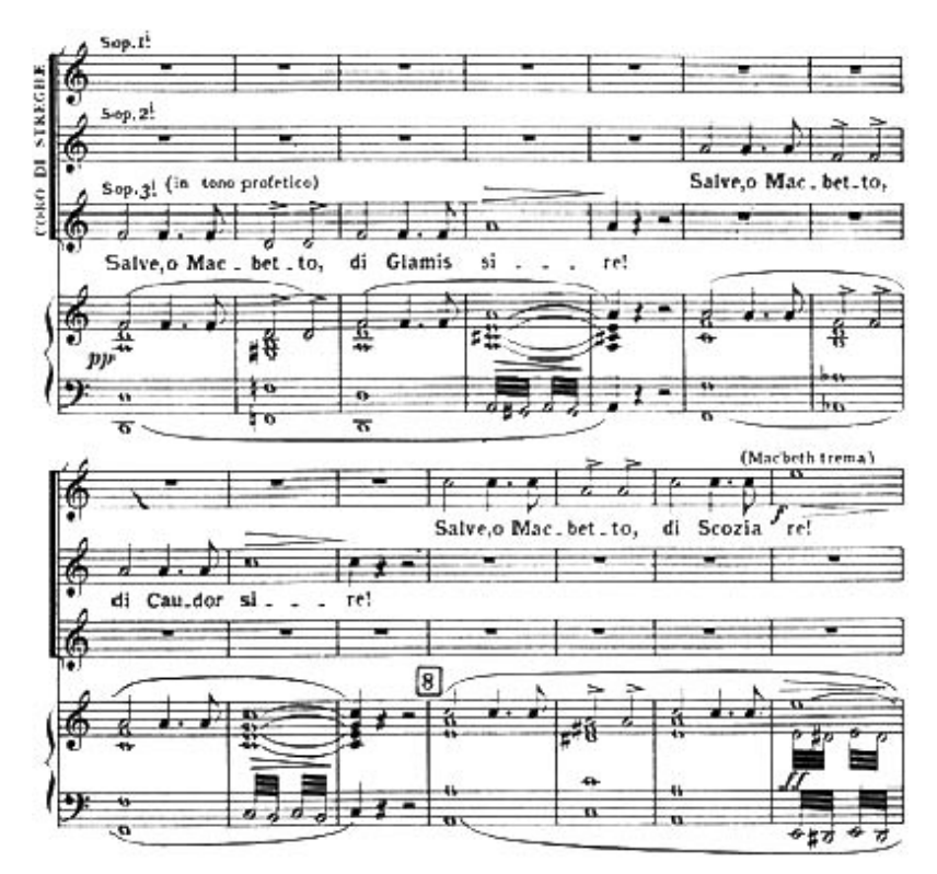
Ex. 2: Verdi, Macbeth, 'Hail!'

interruption of it. An epigram is not an episode in a symphonic development but a unit of music theatre, in which music objectifies itself into something abrupt, hieroglyphic, legible. Often it follows the exact contours of words: but it is the meaning of the words, not the phonetic structure, that the epigram seeks to memorise, to freeze.