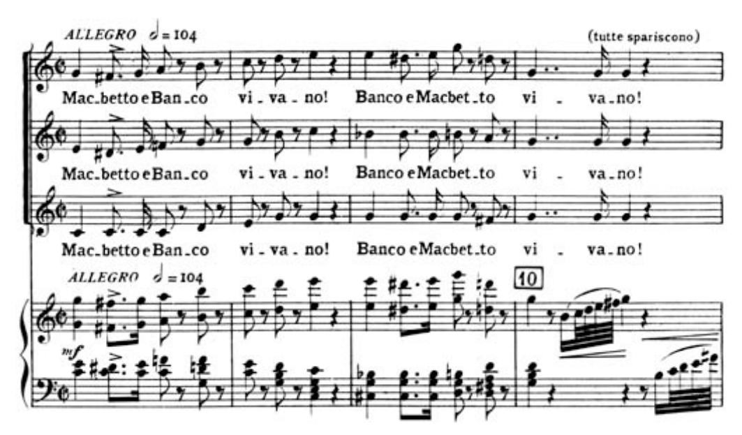
Ex. 4: Long live Macbeth and Banquo!

heart of their spectacles of terror. The sash with its mystifying alphabet is fastened loosely, and tends to fall off, exposing the witches as silly raggedy old women with a gift for freak shows. They dismiss Macbeth, and the human race, and finally themselves. Beginning as instruments of tragedy, agents of a divinity that shapes our ends, rough-hew them how we will, the witches end as vehicles of a universal inconsequentiality. Here Verdi and perhaps Shakespeare too go beyond tragedy. Tragedy depends on some sense that Fate has dignity, even if human beings have none; but the witches of Macbeth impinge on a vision of the random. What if Fate itself is a threadbare woman putting on cheap theatrical tricks to tease us with the hope that disorder might be understood as malevolent order?