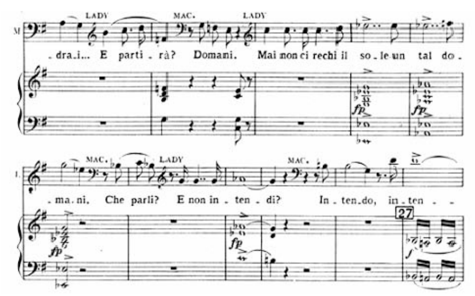
Ex. 5: No tomorrow