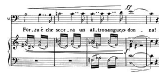
Ex. 8: Other blood must flow