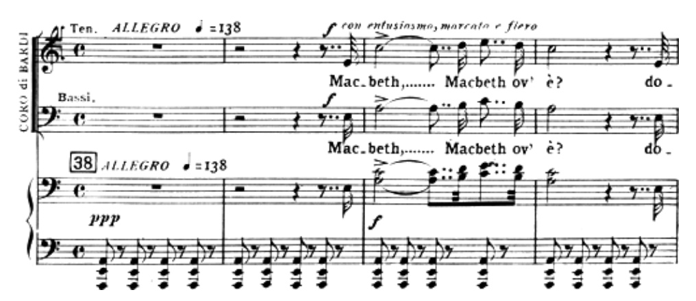
Ex. 16: victory

springy, it has it something of the built-in political activism of Hanns Eisler's marches from the 1930s.