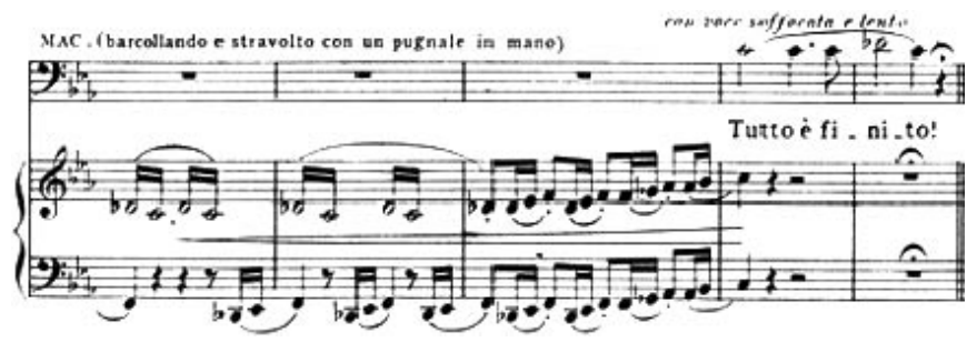
Ex. 10: All done

first act ('Schiudi, inferno'): and the first three bars of the prelude to the second act, obviously recalling 'Tutto è finito', note for note; and even the words 'Una macchia' ('a stain') in the sleepwalking scene, a subtle recollection.<sup>21</sup> This little figure is the music-icon of the stain that can't be washed out – and since in a tragedy falling minor seconds, the basic figure of desolation since the days of Monteverdi's stile molle , are likely to be everywhere, Verdi teaches us to read them as an omnipresence of blood. Verdi spatters his score with incriminating spots.