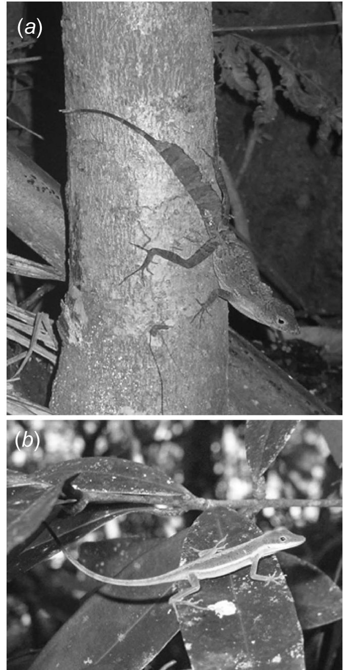
Fig. 1. (a) Anolis gundlachi adult male. (b) Anolis krugi adult male.

that typically perches on trunks of trees 3 m or below, although members of this species also descend to the ground for foraging or territory defense (Rand 1964). Anolis krugi Peters, 1876 (Fig. 1b) is a small-bodied “grass-bush” lizard with a very long tail that is most often found close to the ground in tall grass or small bushes (Rand 1964). Both of these species are common in shaded montane forests of Puerto Rico (Rivero 1998), although they have adapted to use very different microhabitats in this environment.