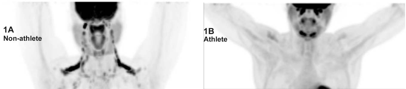
Fig 1. Brown Fat Activity Differences between Athletes and Non-Athletes. (1A) Maximum Intensity Projection of an 18F-FDG PET-CT scan performed in a non-athlete shows multiple and bilateral foci of increased glucose uptake along the laterocervical, supraclavicular, axillary regions, corresponding to metabolically active BAT in these regions. (1B) Maximum Intensity Projection of an 18F-FDG whole body PET-CT scan performed in an athlete. Physiological glucose uptake is seen in the brain, salivary glands and myocardium. No active BAT is seen in this patient.