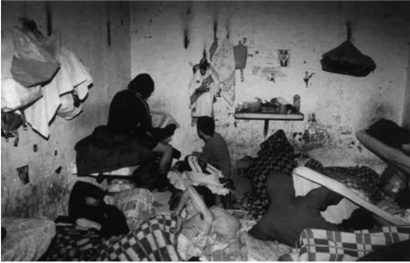
FIG. 1.—Conditions of confinement in the Province of Buenos Aires.

for the custody of inmates. 13 Under the program, offenders stay at home wearing a bracelet on their ankle. The bracelet transmits a signal to a receptor installed in the offender's house. If the signal is interrupted, manipulation is detected, or vital signs of the individual are not received, the receptor sends a signal to the service provider through a telephone line. The private provider investigates the reason for the signal and, whenever necessary, reports to the EM office of the Buenos Aires Penitentiary Service, which sends a patrol unit to the inmate's house. The contractor is the South American representative of a leading international provider. The fee paid by the provincial government in May 2007 was AR$32 per day (equivalent to approximately $10 in May 2007).