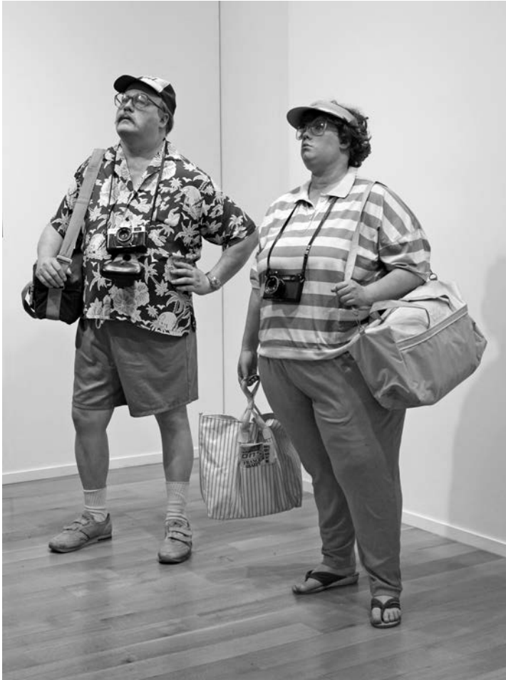
Figure 3. Duane Hanson, Tourists II (1988).