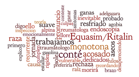
FIGURE 3: Text-based predictors of suicidal ideation from NLP (Spanish).