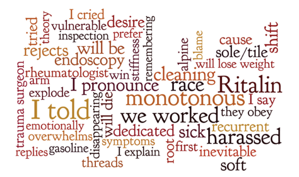
FIGURE 2: Word map of text-based predictors of suicidal ideation from NLP (English).