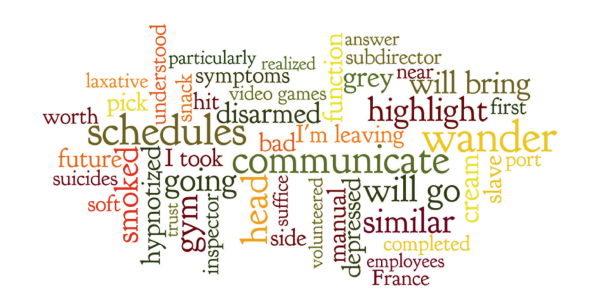
FIGURE 4: Word map of text-based predictors of GHQ-12 \ge 4 from NLP (English).

The preliminary evidence from this project demonstrates that NLP-based modeling has the potential to be an important tool for preventing suicide among young adults that frequently use text or social media. The technology could be extended to generate risk flags for patient messages sent to physicians, who could then intervene for a potentially suicidal patient. In nonclinical settings, publicly available, user-generated text may be a less expensive and less invasive data collection method for identifying persons at risk of suicide or monitoring trends in suicidal ideation. For people identified as at risk for suicide who are in nonclinical settings, resources such as crisis text lines could be made available instantly and electronically.