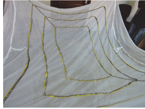
FIGURE 2: Top view of SmartNet.

Compared to asking individuals or household representatives about their bednet use, more objective means of measuring bednet use have been attempted but are problematic. Spot checks during sleeping hours [17–19], while the most accurate, are invasive and unlikely to be acceptable to most populations. Visually confirming that bednets are mounted above sleeping areas in households [20–24] is also invasive, requiring entry into households, and does not ensure that a bednet is actually being unfurled at night.