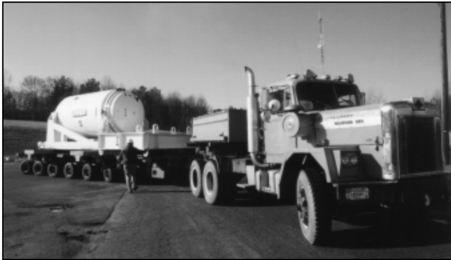
Figure 2.4: A spent fuel cask loaded on a truck for transport

Recently, the NRC has published detailed new analyses suggesting that the risk is even lower than their previous studies had concluded. 42 In the United States, for example, in roughly 1300 commercial spent fuel shipments between 1979 and 1995 (1045 by highway and 261 by rail), there were 8 accidents, none of which damaged the fuel casks, compromised the shielding, or caused any release of radioactive material. 43 Worldwide, over 88,000 tonnes of spent fuel had been shipped by 1995 by sea, road, and rail, with an excellent safety record. 44 It seems clear that the