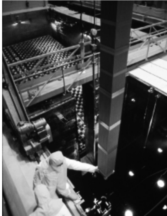
Figure 2.1: Spent fuel assembly being lowered into a storage pool

regulation, these safety goals are not difficult to achieve, but there have been incidents in the United States, for example, which suggest that more careful attention to pool storage safety would be desirable. 5