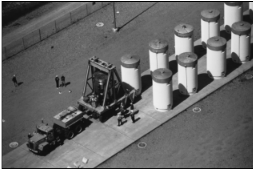
Figure 2.2: Concrete storage casks at a U.S. nuclear power plant

In a cask system, a flat concrete pad is provided (either outdoors or within a building), and large casks that contain the spent fuel can be added as needed to store the amount of fuel required. The casks provide both shielding and containment. The initial cost of establishing the facility is small, and the operating costs once the fuel is loaded are also small, but the capital cost of the casks themselves is significant; as each cask costs roughly the same amount as previous casks, there are few economies of scale in storing more fuel. For an at-reactor facility, the fuel can typically be moved from the pool to a dry cask using primarily fuel handling equipment already available at the reactor site. A wide variety of specific cask designs are available from several manufacturers, including both metal and concrete casks (the latter typically having metal inner liners). 12 Originally, like vaults and silos, casks were designed only for storage (so-called “single purpose” casks). More recently, some cask designs have been