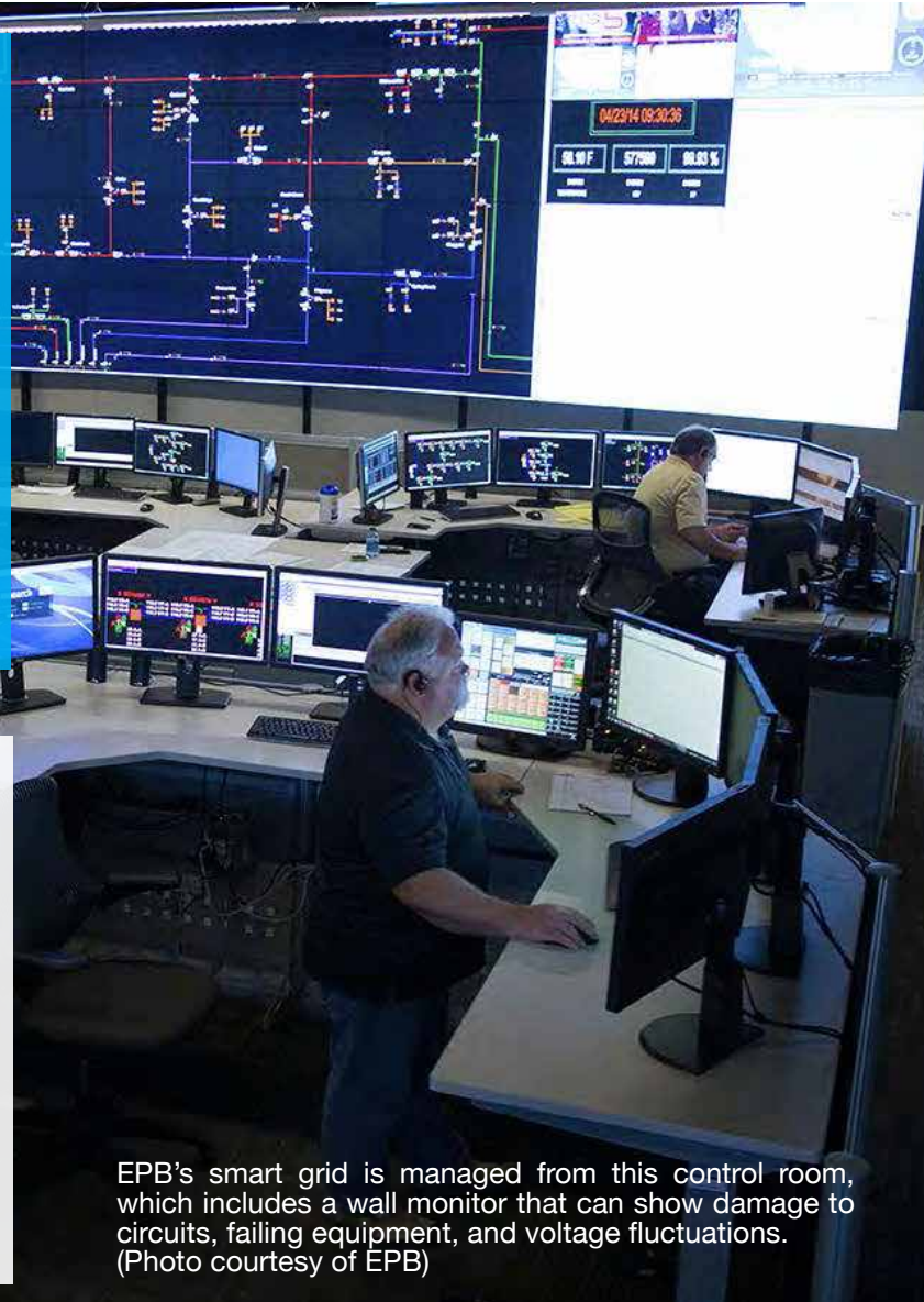
EPB's smart grid is managed from this control room, which includes a wall monitor that can show damage to circuits, failing equipment, and voltage fluctuations.