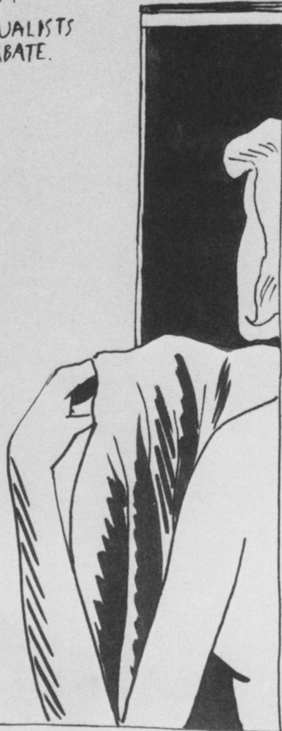
Raymond Pettibon. Untitled. 1986.